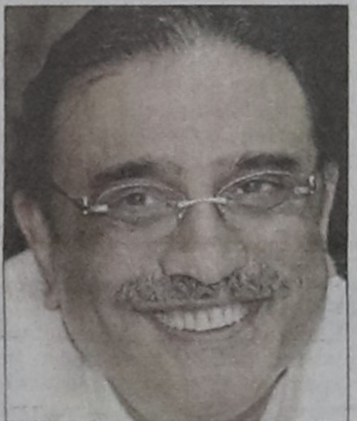
Asif Ali Zardari

The widower of Pakistan's assassinated former premier Benazir Bhutto has decided to run for president in the wake of Pervez Musharraf's resignation, a senior party official said yesterday. Asif Ali Zardari on Friday won the backing of lawmakers from the Pakistan People's Party (PPP) to contest the September 6 poll to choose a successor to Musharraf, who stepped down on Monday amid the threat of impeachment. "Mr Asif Zardari has accepted to contest the election for the office of president of Pakistan after the party unanimously drafted him to do so," PPP deputy secretary general Raza Rabbani told reporters. Rabbani said Zardari had been chosen in part in tribute to the sacrifices of his wife, who was killed in a suicide attack at an election rally in December.