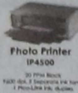
Photo Printer IP4500 30 ppm, B&W 1440 dpi, 4800 dpi resolution 4 Photo 10x15 cm prints