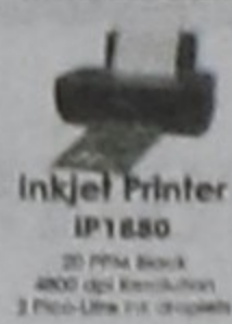
Inkjet Printer IP1880 30 ppm, B&W 4800 dpi resolution 2 Photo 10x15 cm prints

J.A.N. ASSOCIATES LTD. 13/1 Fatima Arcade (2nd floor), Road No-5, Dharmapada R/A, Dhaka-1205 Tel: 8664101, 8660801, 8611444 Fax: 880-2-8610410 E-mail: jan-mat@global-bd.net