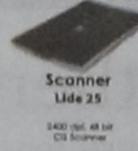
Scanner U225 2400 dpi, 4800 dpi CIS Sensor

Branch: SR-130, BCS Computer City, IDB Bhaban, Dhaka. Phone: 8124941 Elephant Road: Shop-606-607, Level-6, Multiplan Centre, Elephant Road, Dhaka Printer Service Centre: SGR-28, BCS Computer City, IDB Bhaban, Dhaka. Phone: 01727-021635 Camera Service Centre: SR-130, BCS Computer City, IDB Bhaban, Dhaka. Phone: 8124941 Canon Display Centre: SGR-29, BCS Computer City, IDB Bhaban, Dhaka