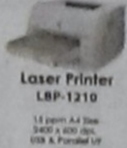
Laser Printer LBP-1210 12 ppm, B&W 2400 x 600 dpi USB & Parallel I/O