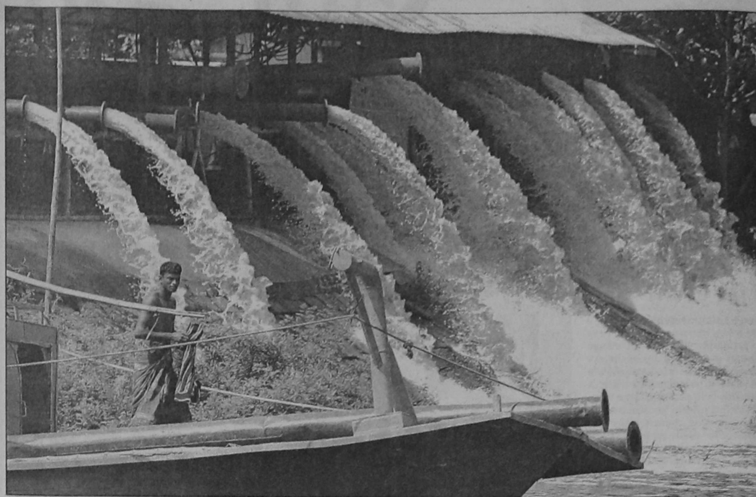
Dhaka Water and Sewerage Authority (Wasa) pumps out water from Begunbari-Badda lake into a canal connecting to river Balu in order to remove the city's waterlogging problem. The picture was taken at the Wasa pump house at Rampura yesterday.