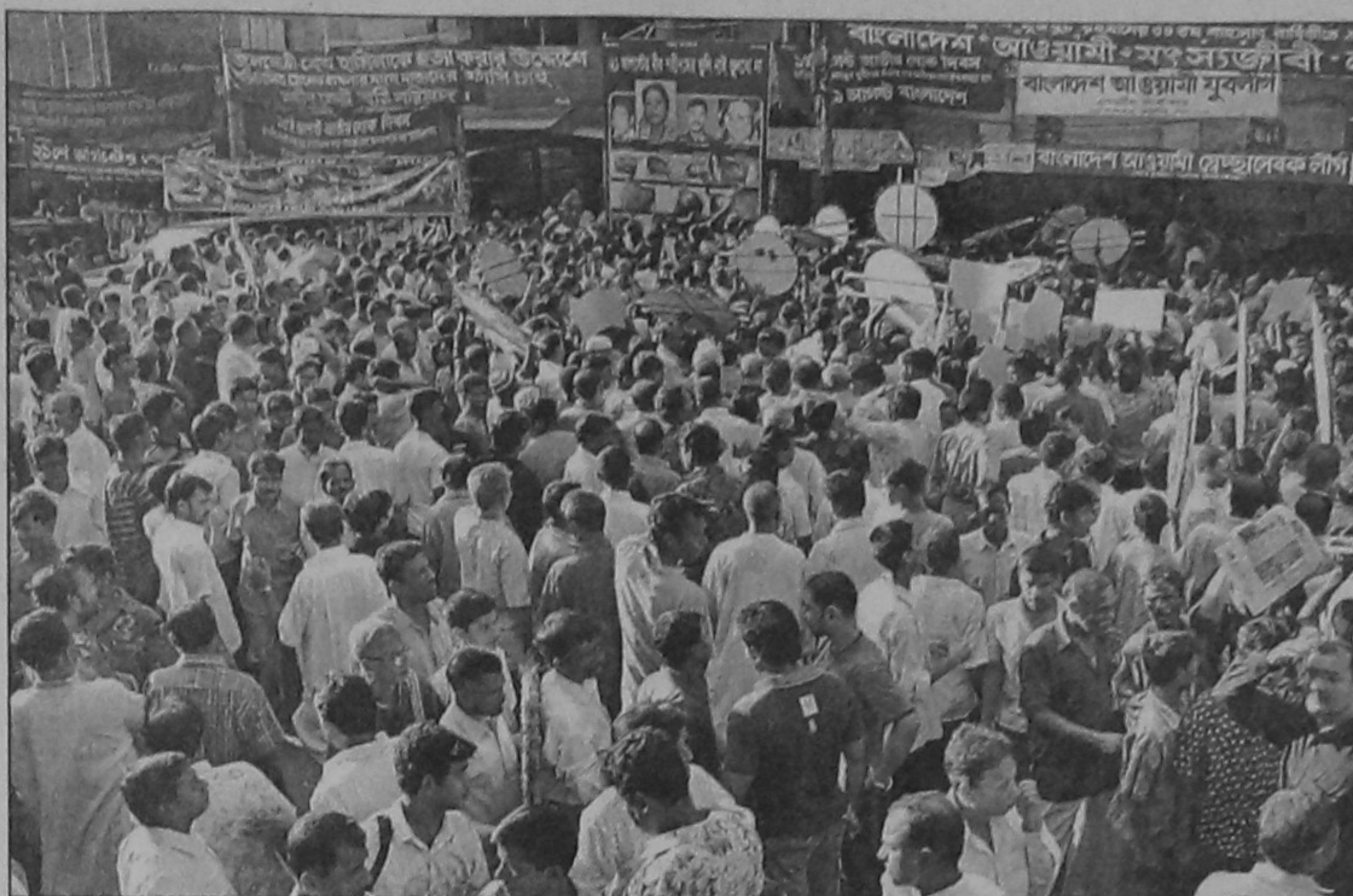
Hundreds of leaders and activists of Awami League gather in front of the party office at Bangabandhu Avenue in the city yesterday to pay homage to those killed in a grenade attack on a party rally on August 21 in 2004. (Story on page 1)

Relatives, admirers and well-wishers are requested to attend the chehlum.