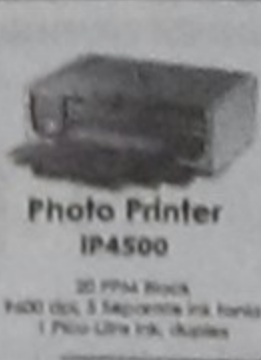
Photo Printer IP4500