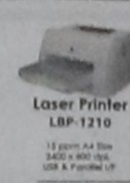
Laser Printer LBP-1210