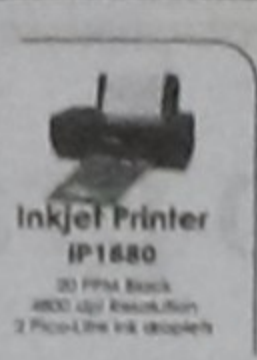
Inkjet Printer IP1800

13/1 Fatima Arcade (2nd floor), Road No-5, Dhanmondi R/A, Dhaka-1205 Tel: 9664101, 9660001, 8611444 Fax: 880-2-8610410 E-mail: jan-mkt@global-bd.net