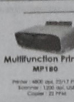
Multifunction Printer MP180