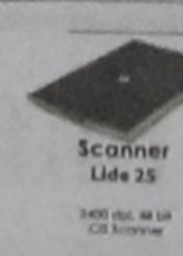
Scanner Ude 25

Branch: SR-130, BCS Computer City, IDB Bhaban, Dhaka. Phone: 8124941 Elephant Road : Shop - 606-607, Level-6, Multiplex Centre, Elephant Road, Dhaka Printer Service Centre: SGR-28, BCS Computer City, IDB Bhaban, Dhaka. Phone: 01727-021635 Camera Service Centre: SR-130, BCS Computer City, IDB Bhaban, Dhaka. Phone: 8124941 Canon Display Centre: SGR-29, BCS Computer City, IDB Bhaban, Dhaka