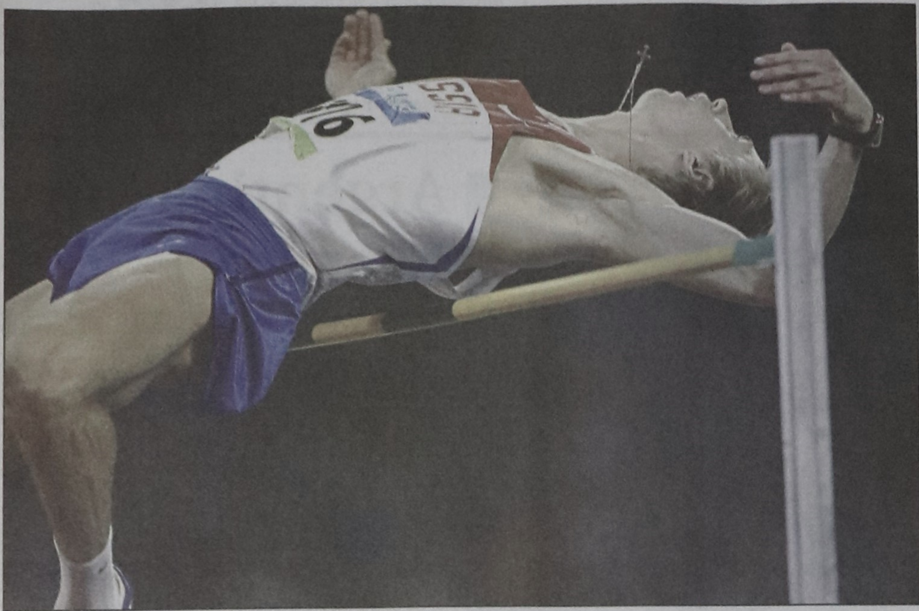
Andrey Silnov of Russia clears 2.34 metres to win the men's high jump gold of the Beijing 2008 Olympic Games at the 'Bird's Nest' National Stadium yesterday.