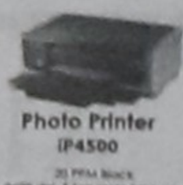
Photo Printer IP4500