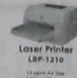
Laser Printer LBP-1210