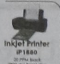
Inkjet Printer IP1880

13/1 Estima Arcade (2nd floor), Road No-5, Dhanmondi R/A, Dhaka-1205 Tel: 9684101, 9680901, 9611444 Fax: 880-2-8610410 Email: jan-mat@globalbd.net