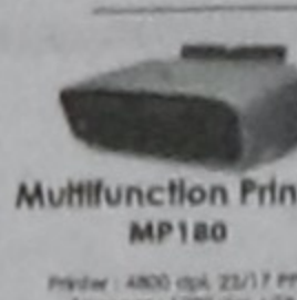
Multifunction Printer MP180