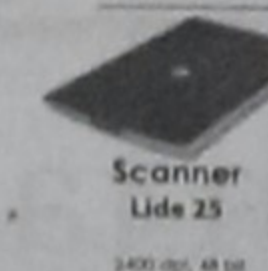
Scanner Lide 25

Branch: SR-130, BCS Computer City, IDB Bhaban, Dhaka. Phone: 8124941 Elephant Road: Shop-606-607, Level-6, Multiplan Centre, Elephant Road, Dhaka Printer Service Centre: SGR-28, BCS Computer City, IDB Bhaban, Dhaka. Phone: 01727-021635 Camera Service Centre: SR-130, BCS Computer City, IDB Bhaban, Dhaka. Phone: 8124941 Canon Display Centre: SGR-29, BCS Computer City, IDB Bhaban, Dhaka