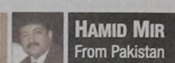
HAMID MIR From Pakistan