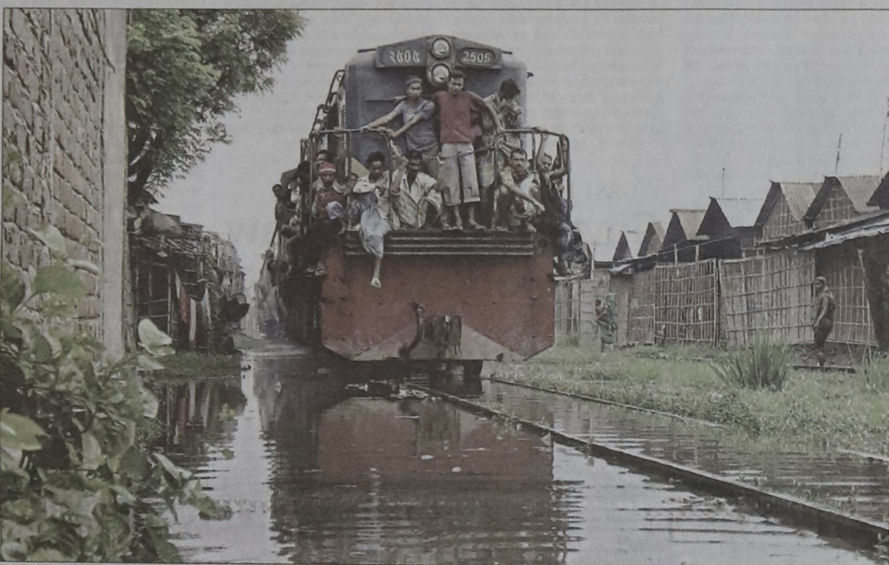
An overcrowded train trundles on the lines between Gandaria Railway Station and Jurain Bazar in the capital yesterday. The entire area along with the train lines there is waterlogged due to poor drainage system.