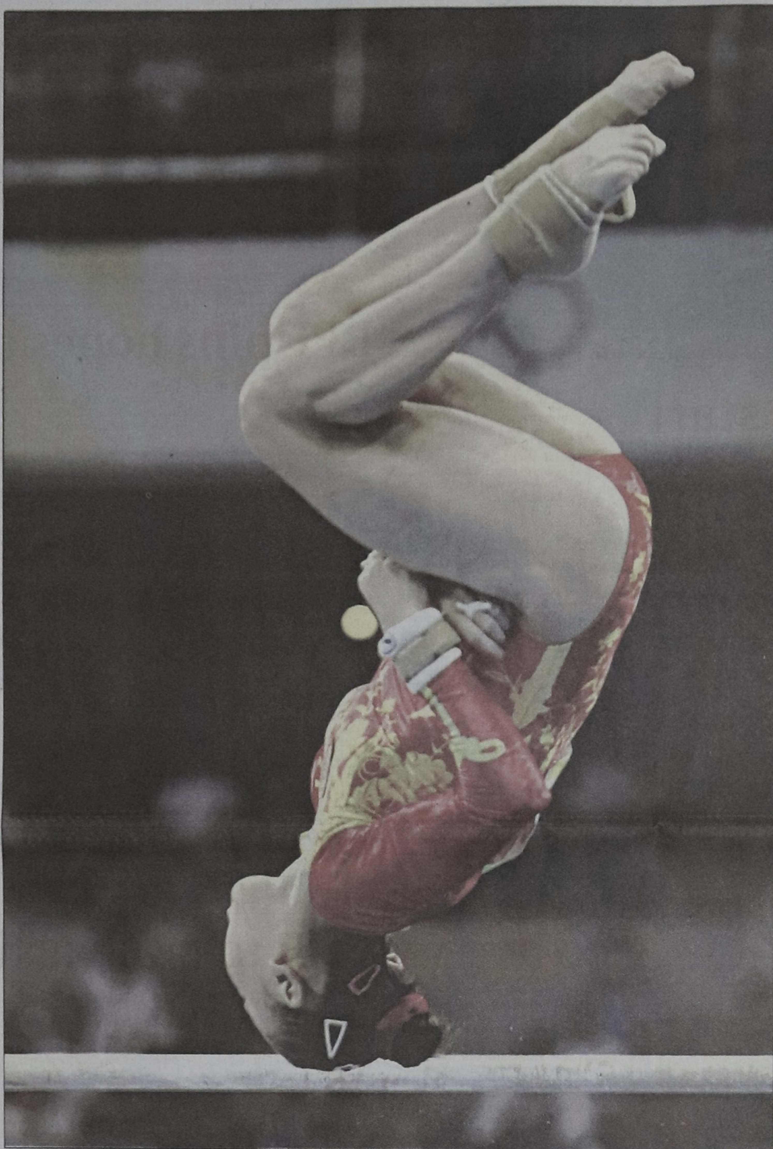
Chinese He Kexin performs her final somersault on way to a perfect landing during the women's uneven bars final of the artistic gymnastics at the 2008 Beijing Olympics yesterday.

What to Watch BTV Beijing Olympic Games Men's Tradition Final Live from 9:40am Aquatics (Women) Live from 12:20pm Men's Weightlifting Live from 1:30pm Men's Football First Semifinal Nigeria v Belgium Live from 4:00pm Second Semifinal Brazil v Argentina Live from 7:00pm