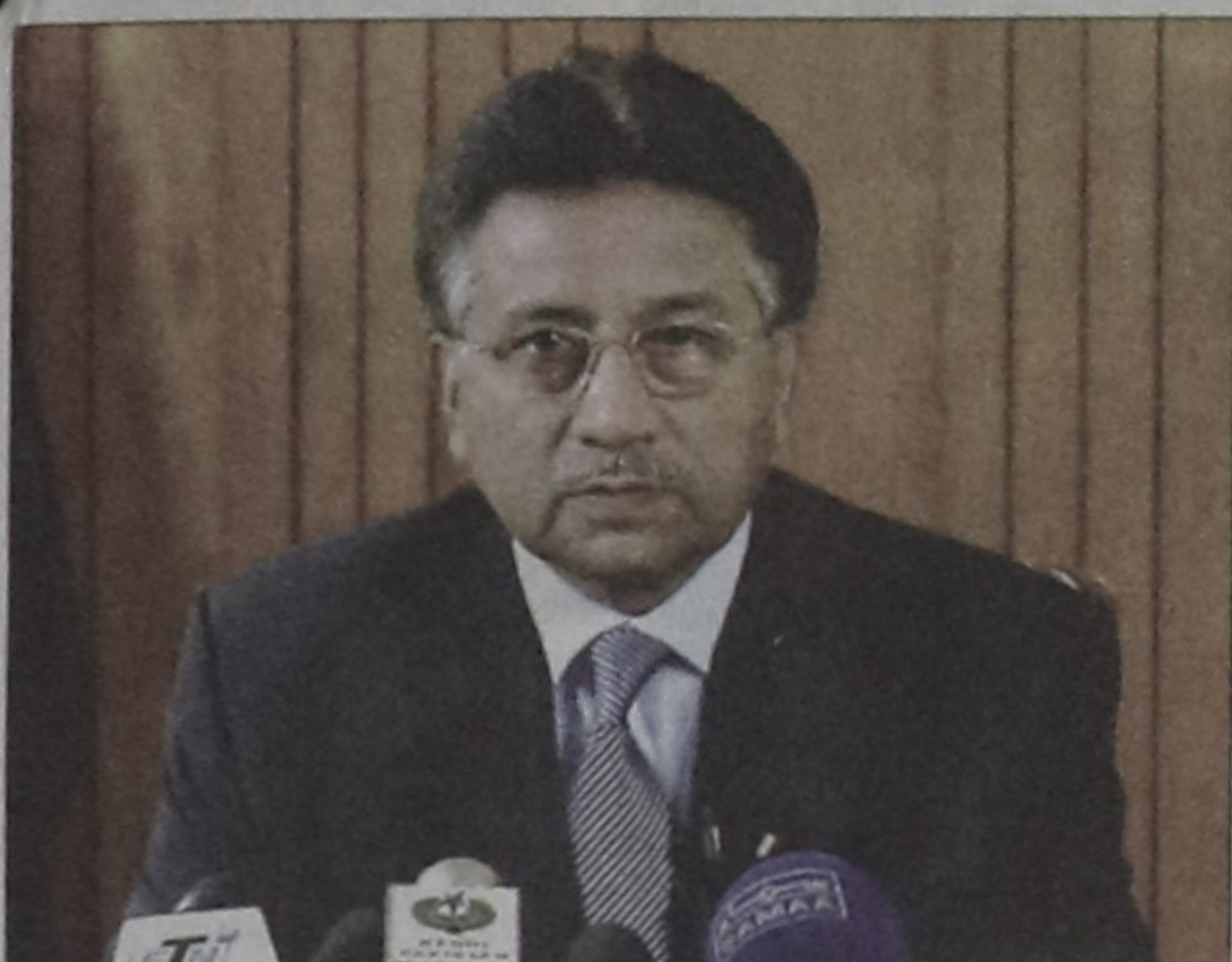
President Musharraf announces his resignation in a televised address to the nation yesterday.

Wild celebrations on streets; world leaders urge stability in Pakistan