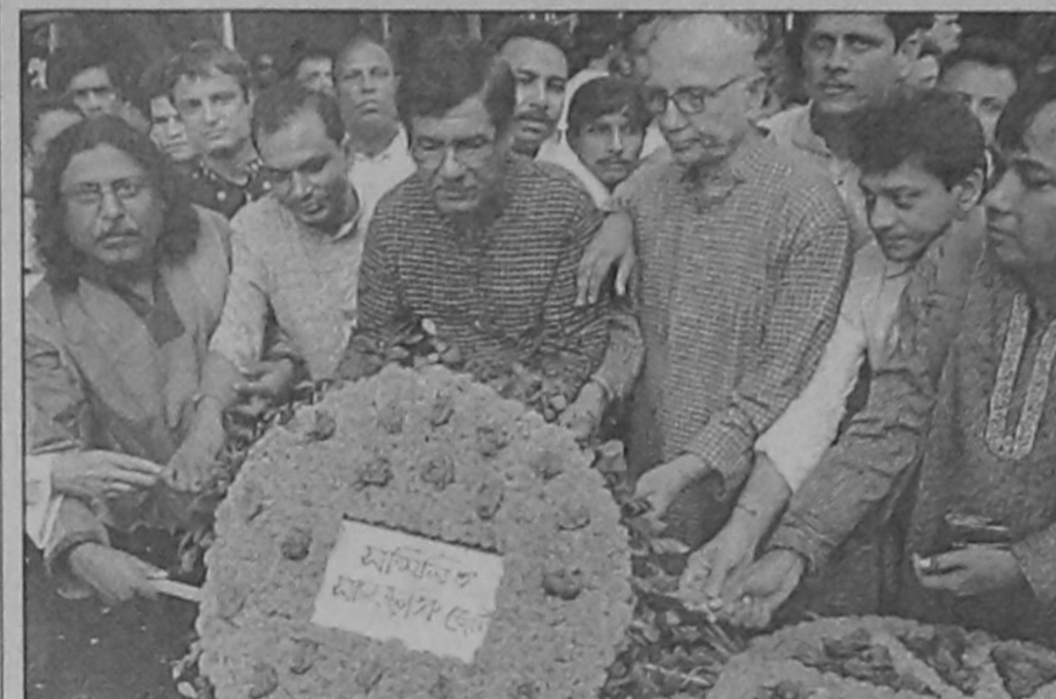
Various socio-cultural and political organisations placed wreaths at the portrait of Bangabandhu Sheikh Mujibur Rahman at Dhanmondi in the city yesterday on the occasion of his 33rd death anniversary. (Clockwise from top right) Awami League, Supreme Court Bar Association, Jatiya Kabita Parishad, Sammilita Sangskritik Jote and Jatiya Samajtantrik Dal place wreaths to pay tribute to Bangabandhu.