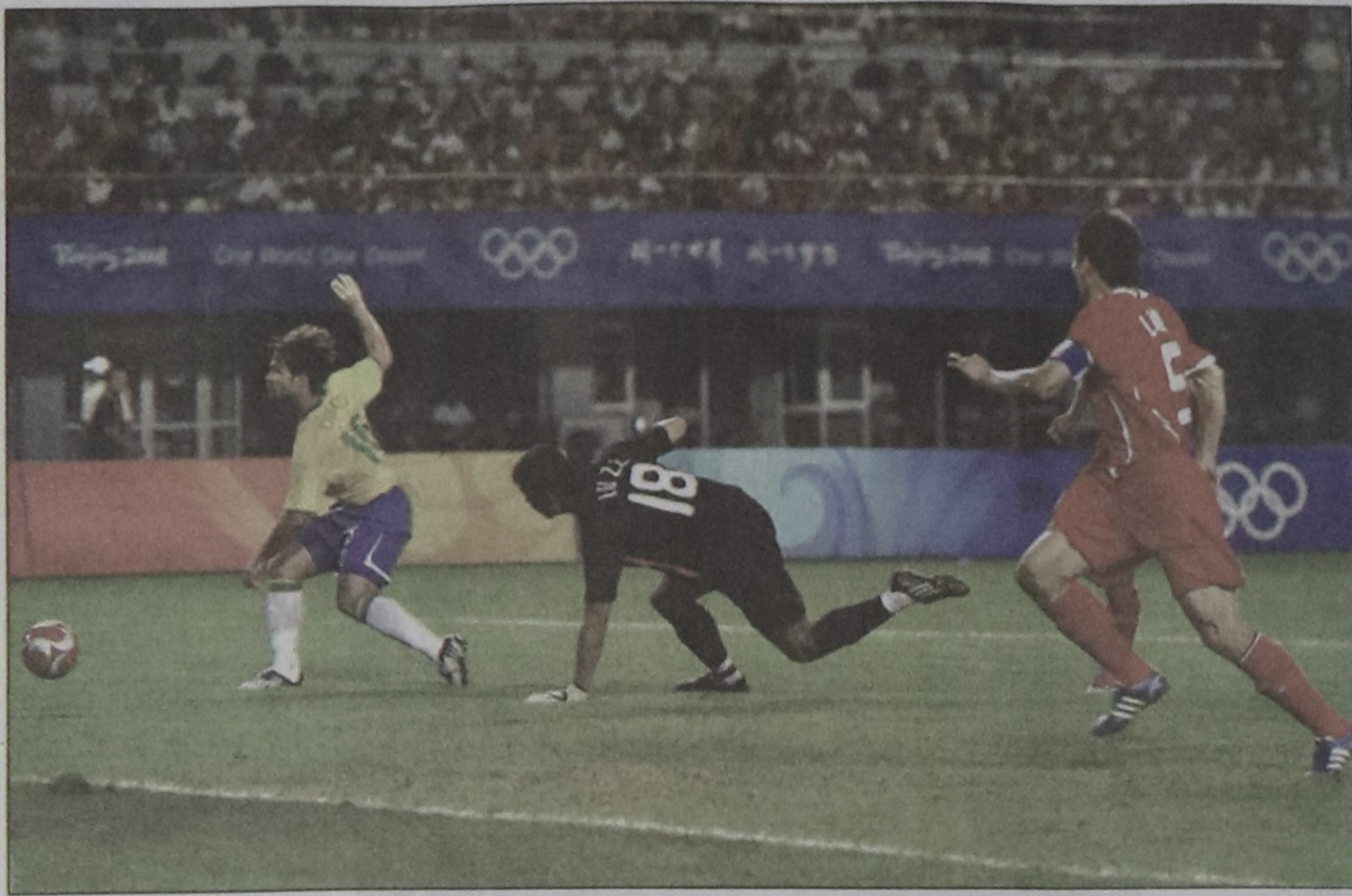
Brazil star Diego (L) scores the opening goal past China goalkeeper Liu Zhenli (C) during the men's preliminary Group C match at the Quinhuangdao Olympic Center Stadium on Wednesday.