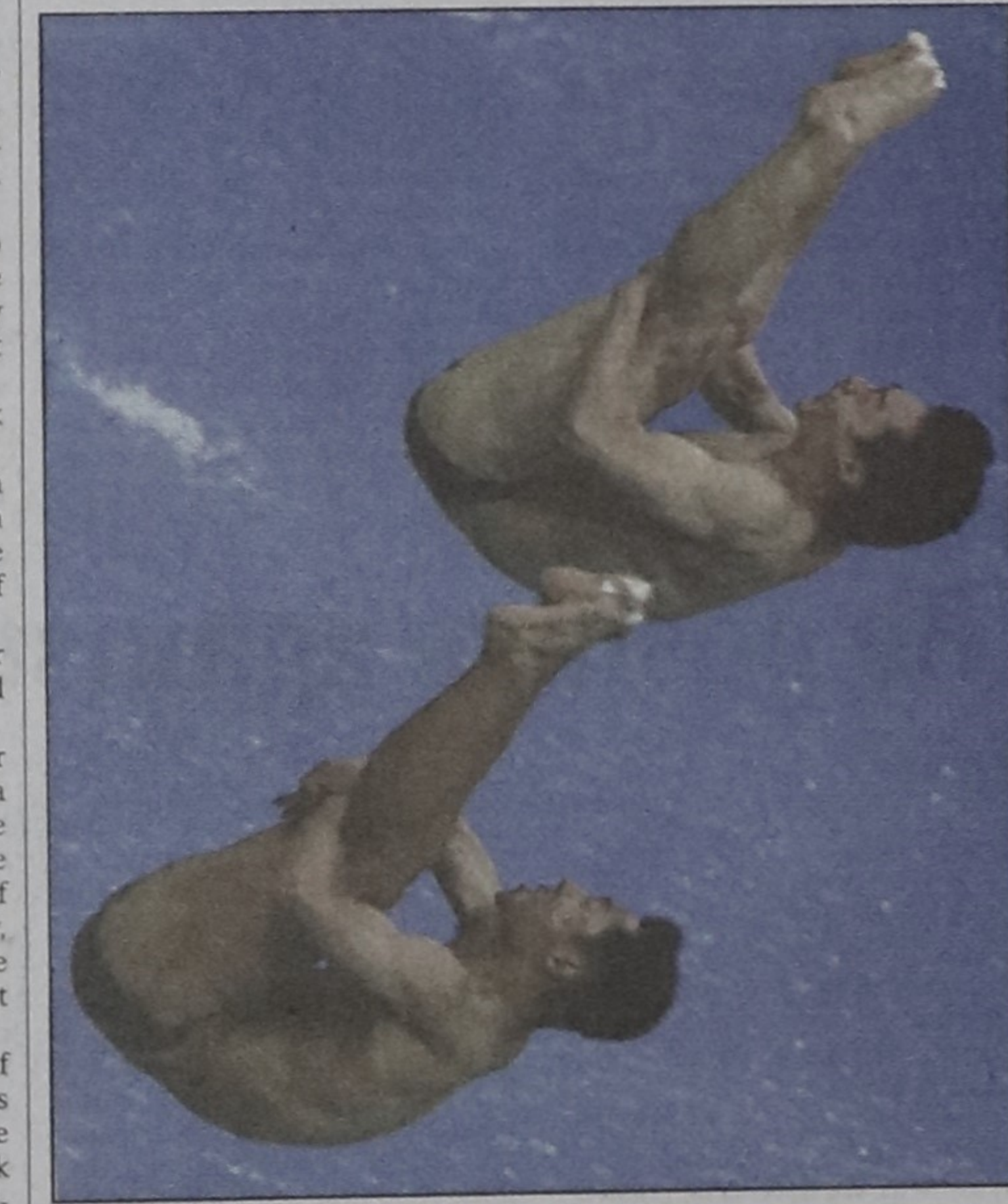
China's Wang Feng and Qin Kai (top) compete during the men's synchronised 3m springboard final at the National Aquatics Centre in the 2008 Beijing Olympics yesterday.

"I knew what it was going to be like. I've been watching the scoring the past few days and I knew it was bad. So I was expecting it," Murray said.