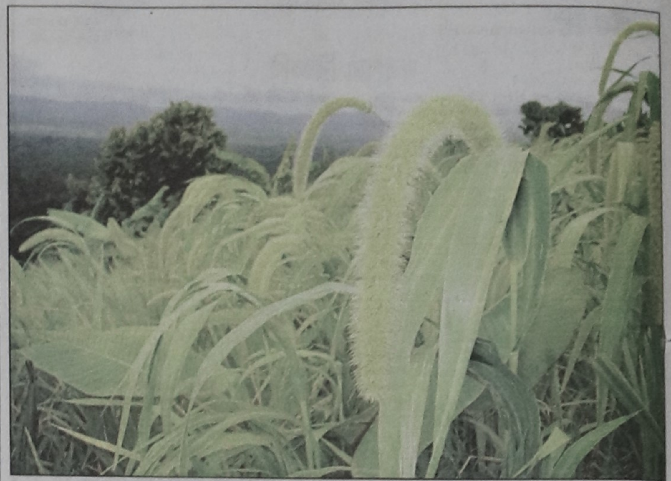
A jhum field near picturesque Shuvranila tourist spot in Bandarban district that sees good yield of the traditional farming this year in Chittagong Hill Tracts.