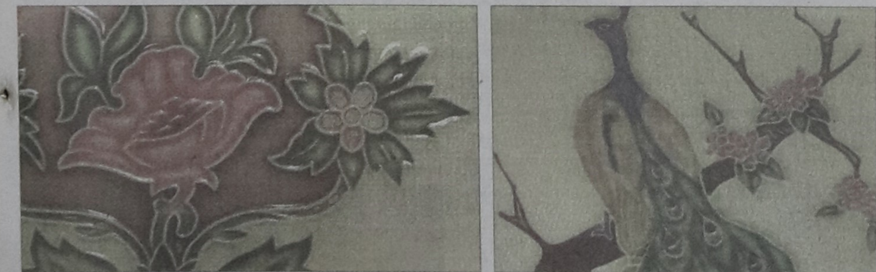
Exquisite tiles displayed at the exhibition.

KAVITA CHARANJI, New Delhi Tiles as an art form? This unusual subject is the theme of an exhibition in New Delhi. Titled Treasure Trove, the People for Animals (an NGO) collection features exquisite handmade and hand-painted 7,000 tiles which date back over 100 years. The tiles can embellish walls, doors, toilets, kitchens, chairs, tables, trays, fire places, bedsides, window sills, doorways and wall hangings.