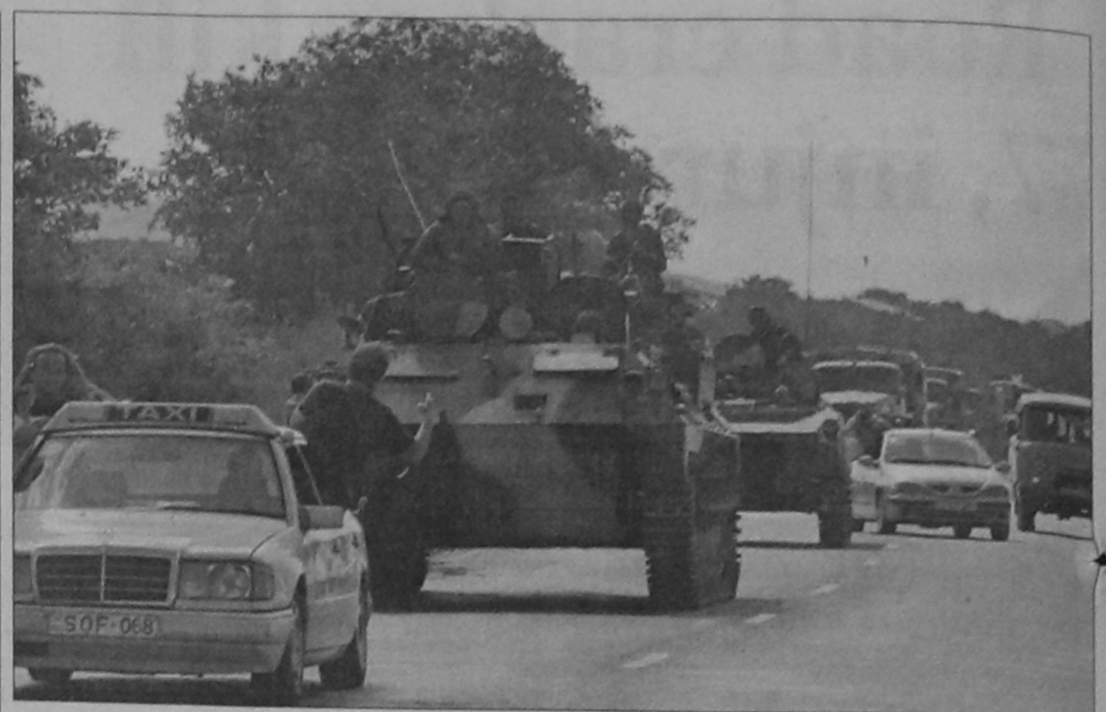
Russian troops, flanked by some journalists, drive out from Gori yesterday some 10km from Gori on the road leading to Tbilisi. European Union foreign ministers called Wednesday on Georgia and Russia to observe "an effective ceasefire" in a joint statement issued at the end of a crisis meeting in Brussels.

Iran has repeatedly denied the allegations, insisting its nuclear drive is aimed solely at providing electricity for its growing population when its fossils fuels run out.