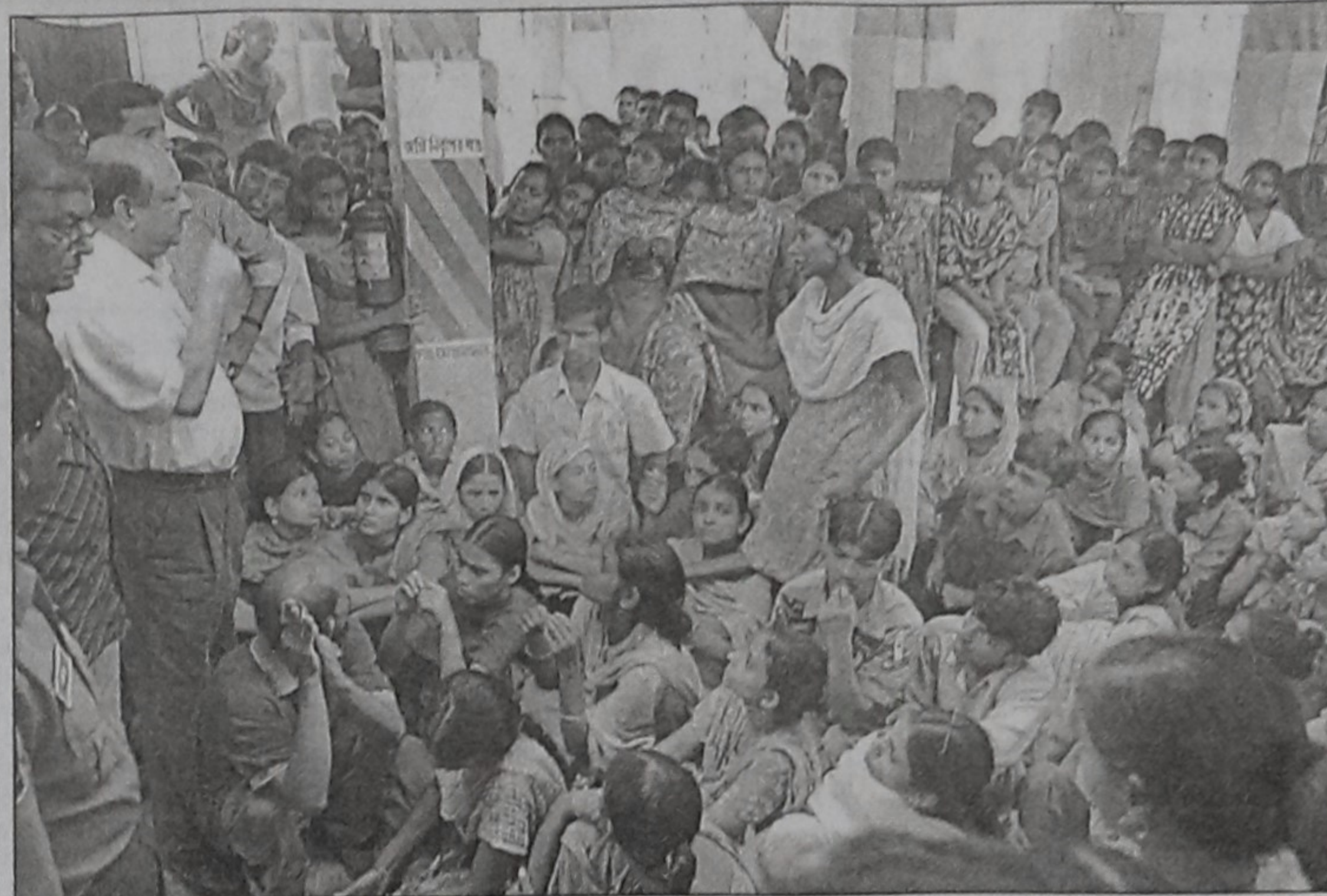
Workers of Stylink Garments Ltd stage a demonstration at Rampura in the city yesterday protesting delay in payment of their salary.