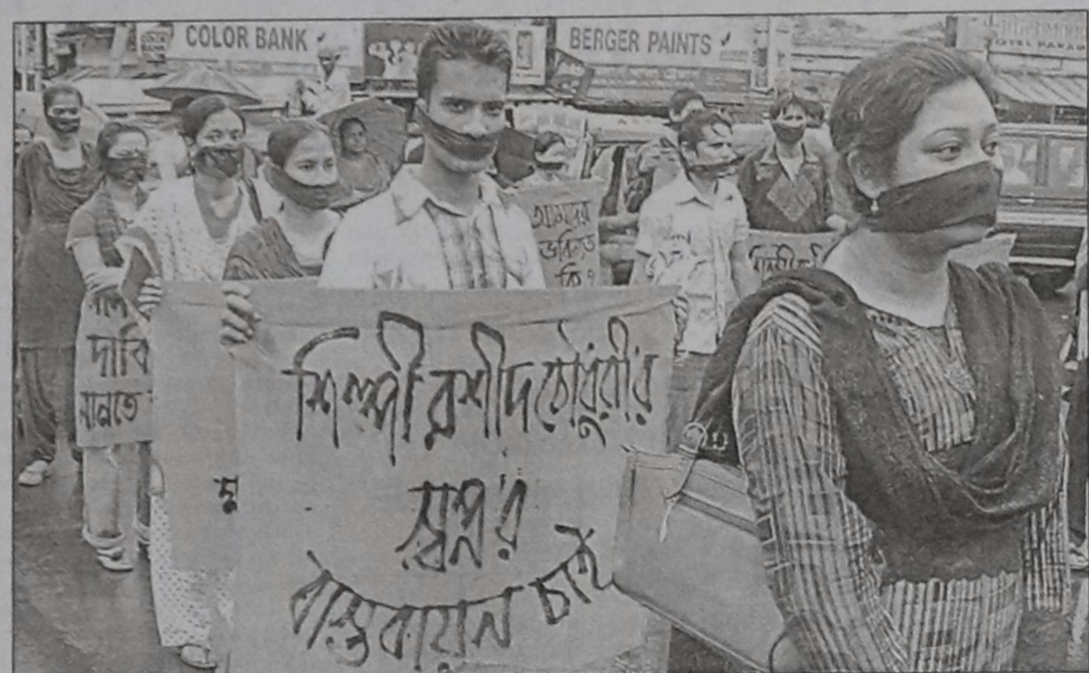
Students of Chittagong Government Art College stage a demonstration in front of Circuit House in the port city yesterday demanding chief adviser's cooperation in saving the college from extinction.

This project can make significant contributions meet the growing demand quality data of the country. For this to happen, however, the World Bank delegates stressed timely and effective implementation of the project.