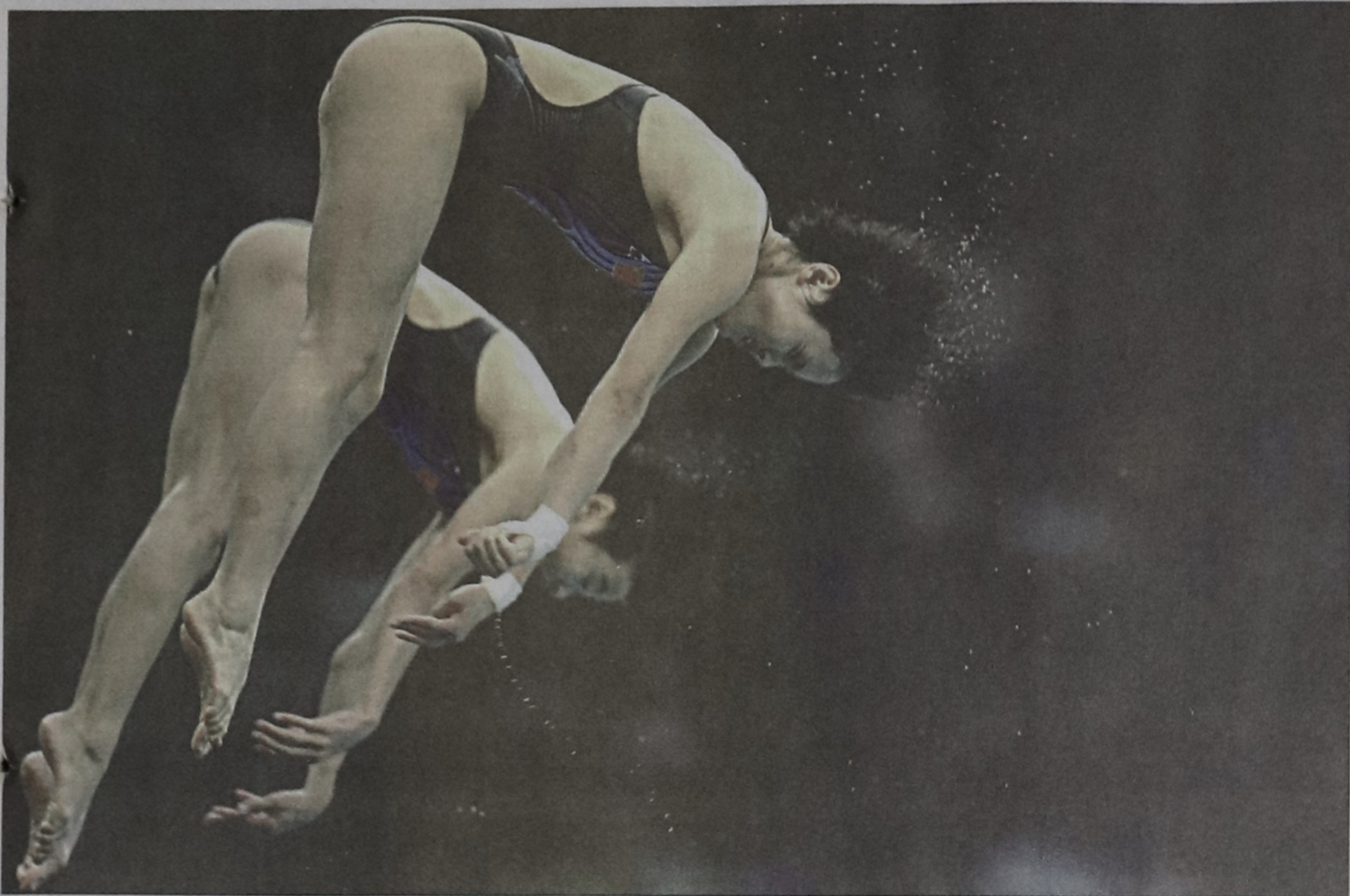
THREE IN THREE: The Chinese pair of Wang Xin (R) and Chen Roulin sets off for a perfect landing to win the gold in the women's 10m synchronised platform diving at the National Aquatics Centre in Beijing yesterday. It was the hosts' third gold in diving.