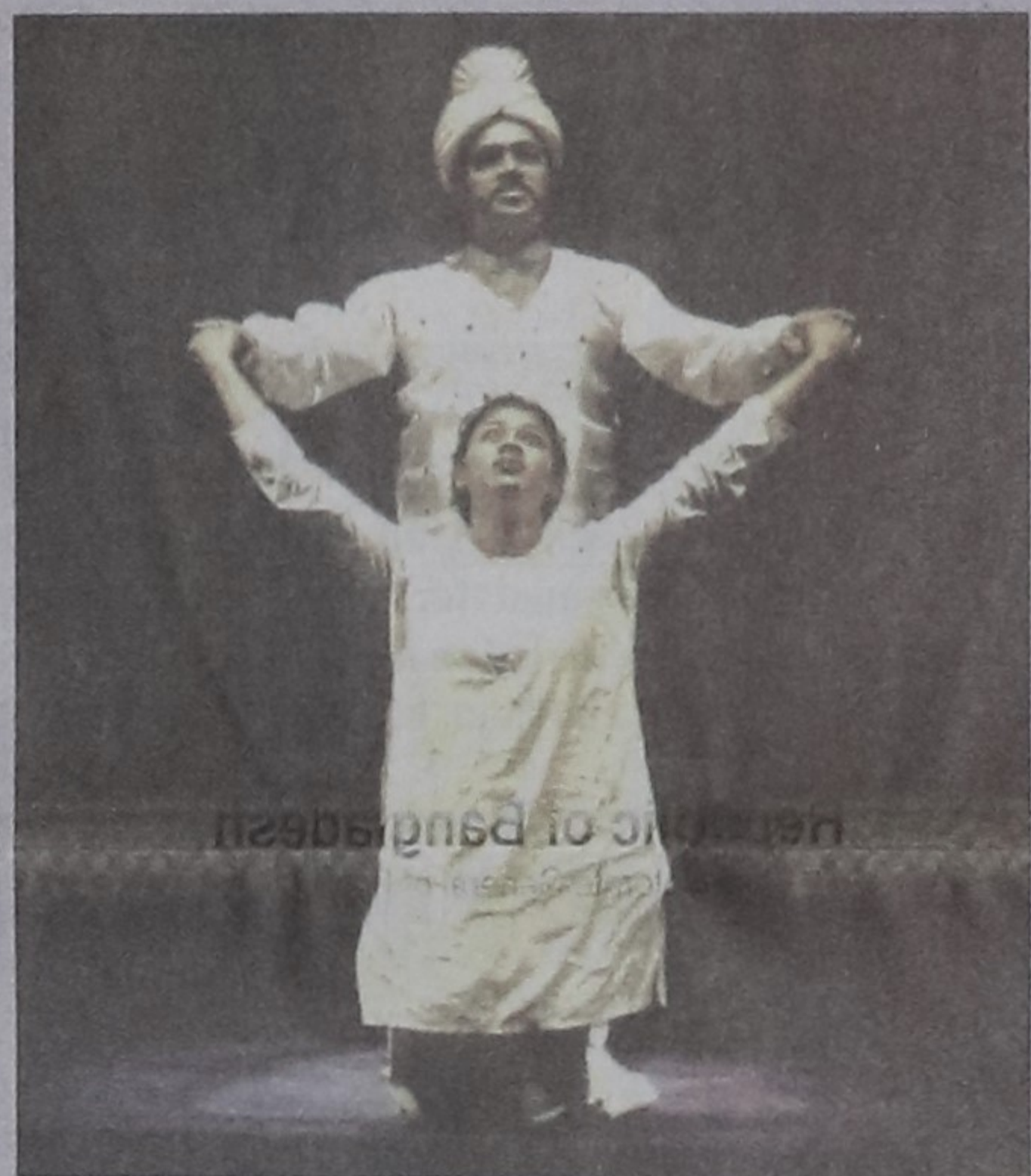
A scene from Swapnodal's production Dakghar .