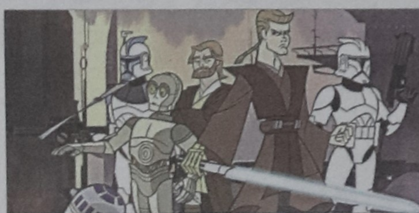
A scene from "Star Wars: The Clone Wars".