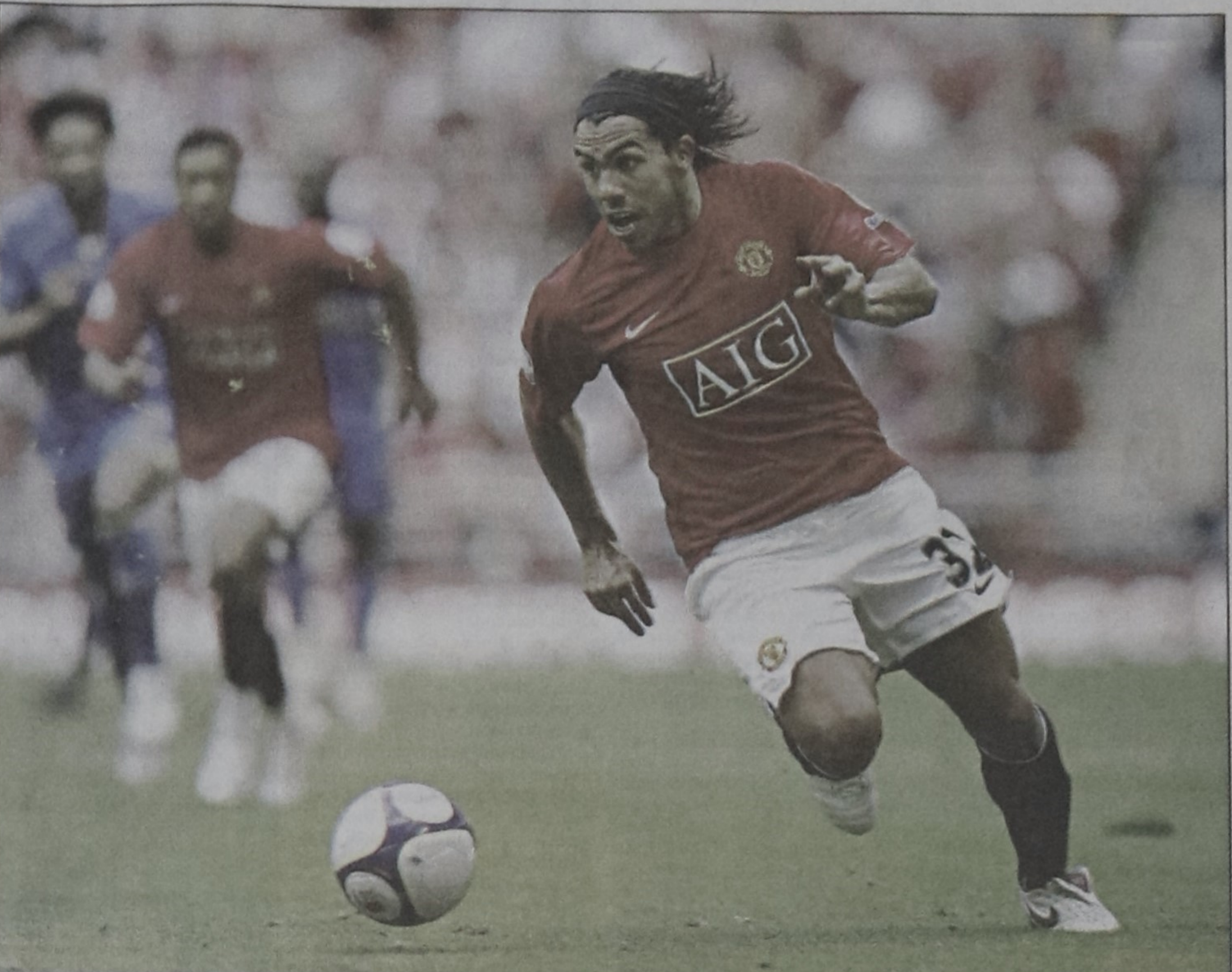
Manchester United striker Carlos Tevez attacks with the ball during their Community Shield tie against Portsmouth at Wembley Stadium in London on Monday. Manchester United won 3-1 on penalties after the match finished 0-0.

James, only for Distin to head clear. Fletcher went even closer soon after half-time when his sublime chip cannoned off the crossbar. Tevez pounded on the rebound but James was quickly back in position to save the Argentine's header.