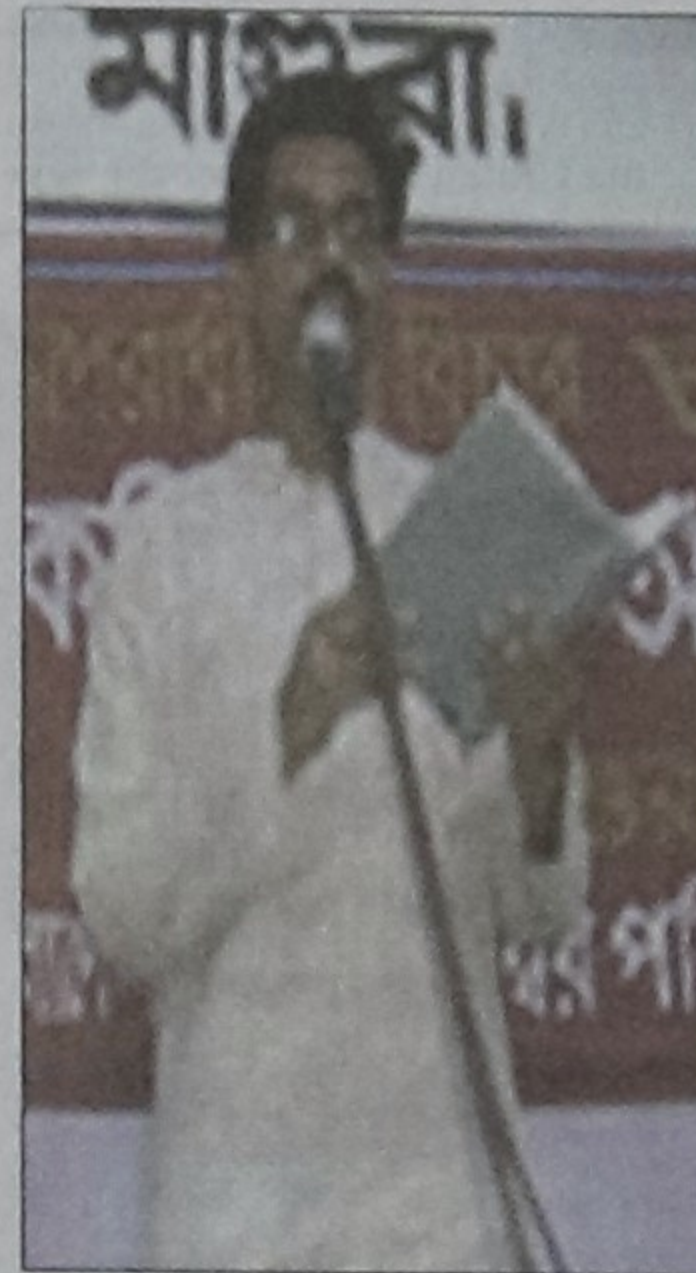
Recitors of 'Kanthabithi' at the programme.