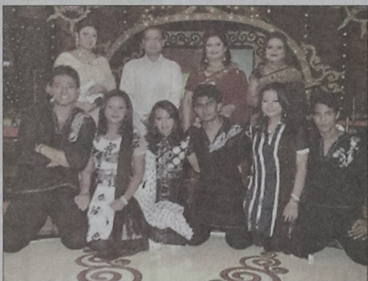
Channel i Shera Kontho '08 On Channel i at 7:50 pm Talent Hunt Judges: Runa Laila and Sabina Yasmin

07:00 Scary Movie 4 08:25 Pitch Black 10:10 D-Tox 11:50 Hollywoodland STAR WORLD 10:30 Koffee With Karan 11:30 Last Comic Standing 12:30 Ugly Betty 01:30 Brothers & Sisters 02:30 The Ellen Degeneres Show 03:30 The Bold And The Beautiful 04:00 General Hospital 05:00 Koffee With Karan 06:00 Falcon Beach 07:00 The Simpsons 07:30 Friends 08:00 Seinfeld 08:30 My Name Is Earl 09:00 Slacked 09:30 The Moment Of Truth 10:30 Prison Break 11:30 It's Fight Night THE HISTORY CHANNEL 10:30 Where Did it Come From 11:30 Eye Max 12:15 Dent King 12:30 The Fight 01:30 Jane Eyre 03:30 Secrets of the Sun 04:30 Modern Marvels 05:30 55 Chevy 06:30 The Fight 07:30 Ancient China 08:30 Doodson Tech 09:30 Mars: The Red Planet 10:30 Mera India 11:30 1975 Firebird NATIONAL GEOGRAPHIC CHANNEL 11:15 Telemall: Sauna Belt 11:30 Inside The Green Berets 12:30 Fight Science 01:30 Desert 02:30 Dragon Hunt 04:30 The Death Adder Duet 05:00 I Didn't Know That 05:30 Onno Loco 06:00 Big Bang 06:30 I Didn't Know That 07:00 What Would Happen If 08:30 Tasmania: Land of Devils 09:30 Countdown Crocs 11:00 What Would Happen If ZEE STUDIO 11:15 Hot Shots 01:15 Amencano 03:10 Hollowman 05:30 Charlie Chaplin 06:00 When A Man Loves A Woman 08:45 Sliding Doors 11:00 Cold Creek Manor