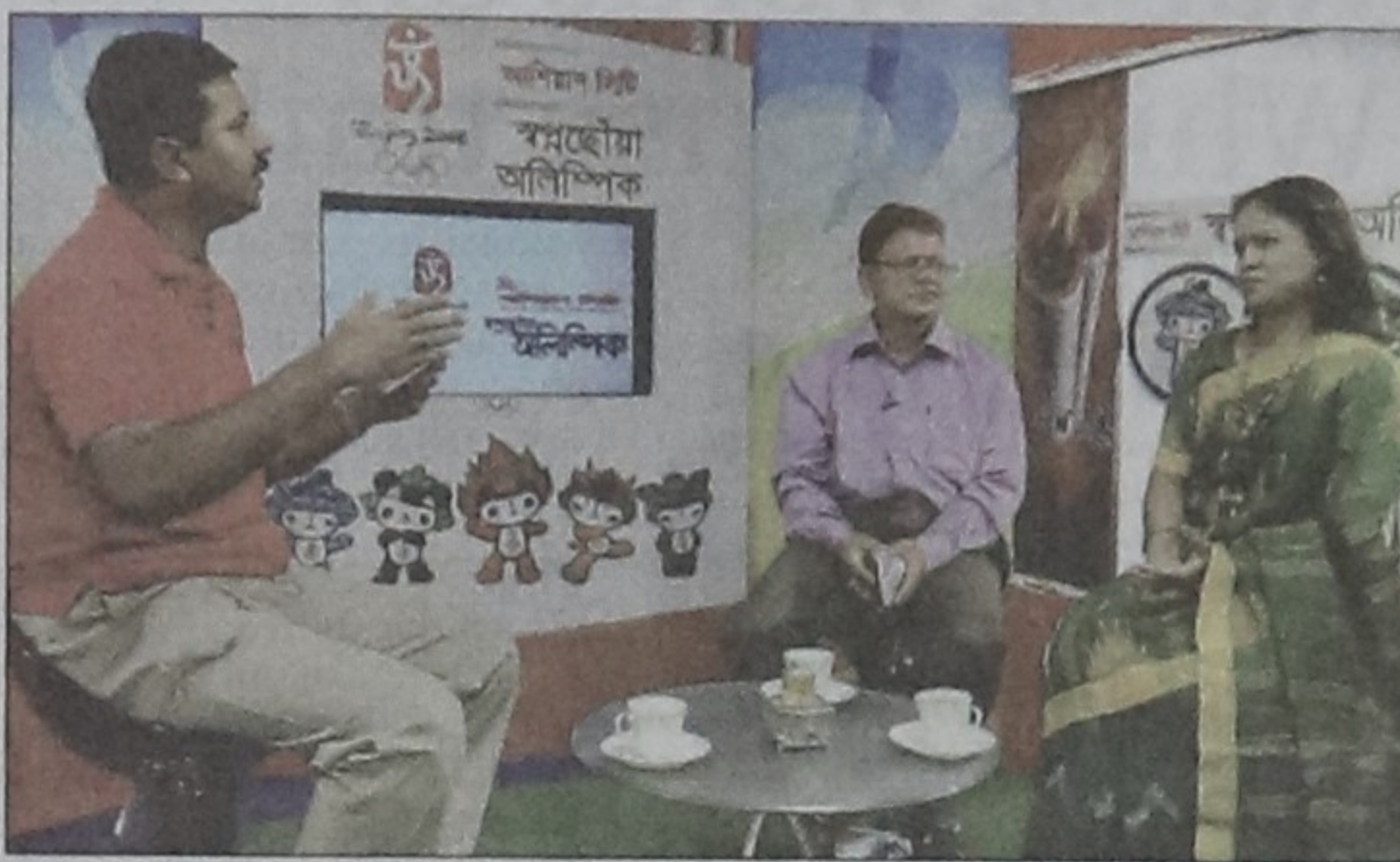
A scene from Ashiyani City Swopnochhowa Olympic .

The programme will feature segments on the participating countries, and on different events of Olympic games. Eminent sports personalities of the country will discuss on several aspects of Olympic. The show will present the history and significance of this grand event. The programme also includes special segments on the Bangladeshi team.