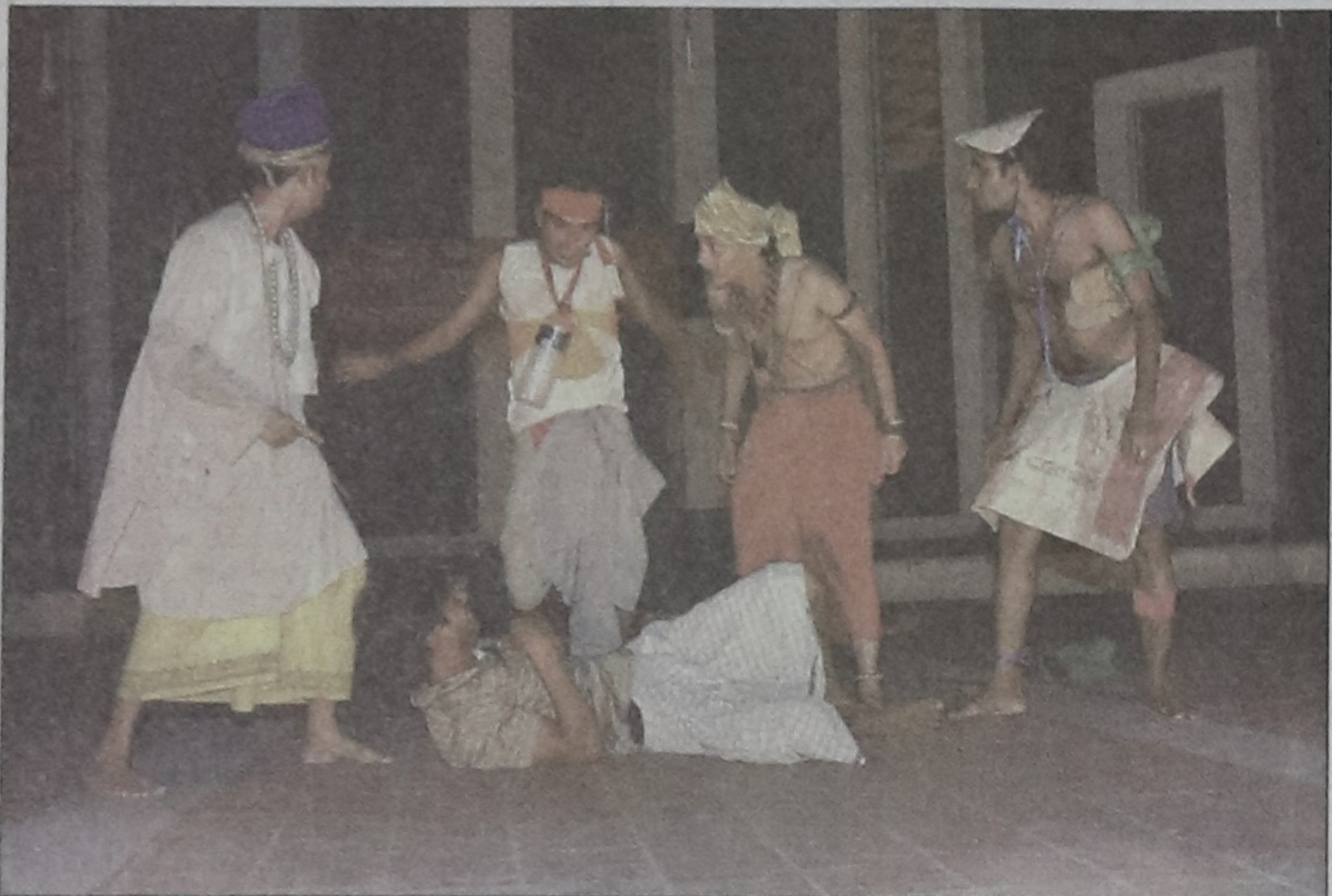
A street play staged at the festival.

Street theatre festival demanding trial of war criminals