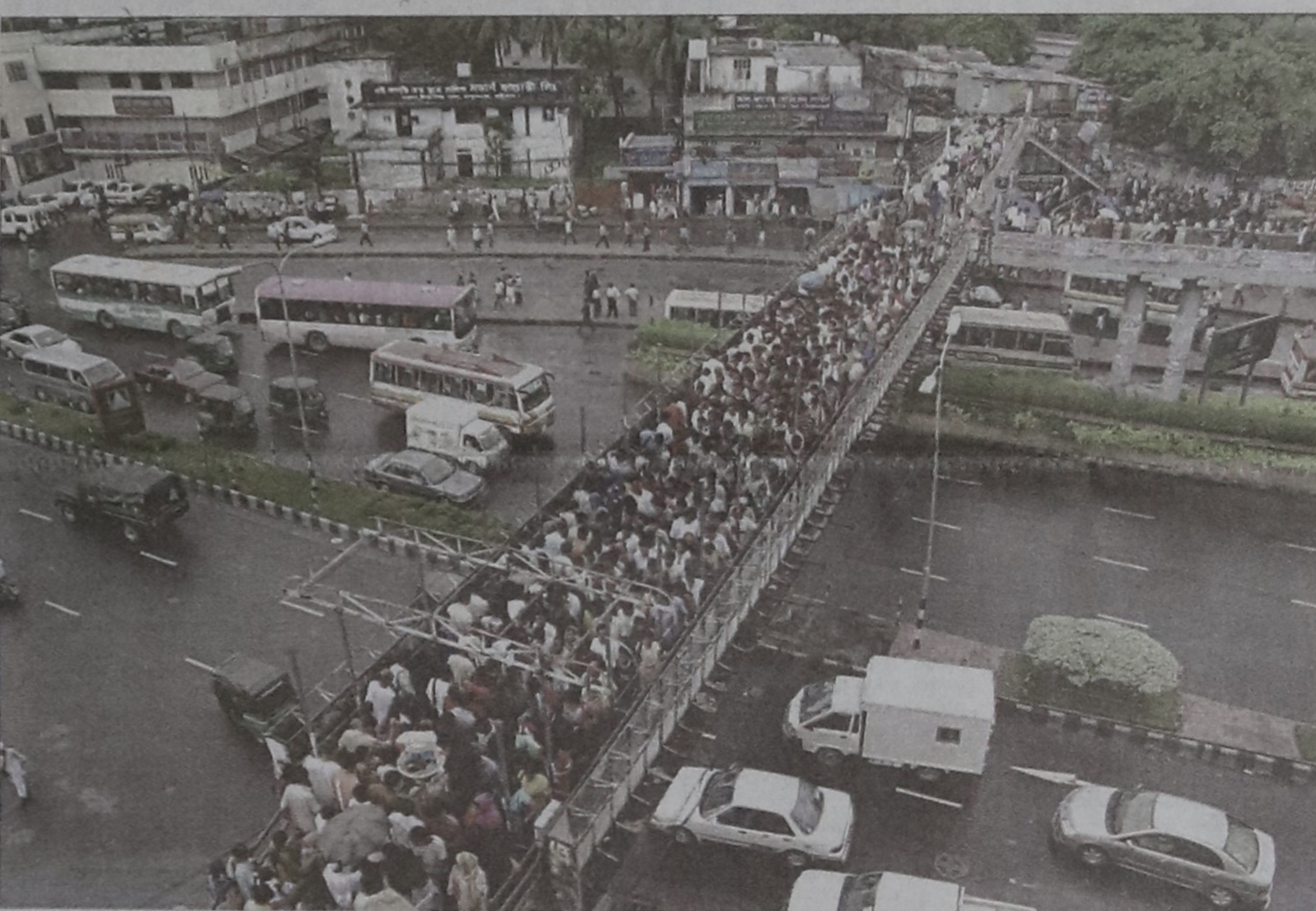
The footbridge at Farmgate is crammed with people during rush hour yesterday as traffic police prevent city dwellers from jaywalking on the busy city intersection.