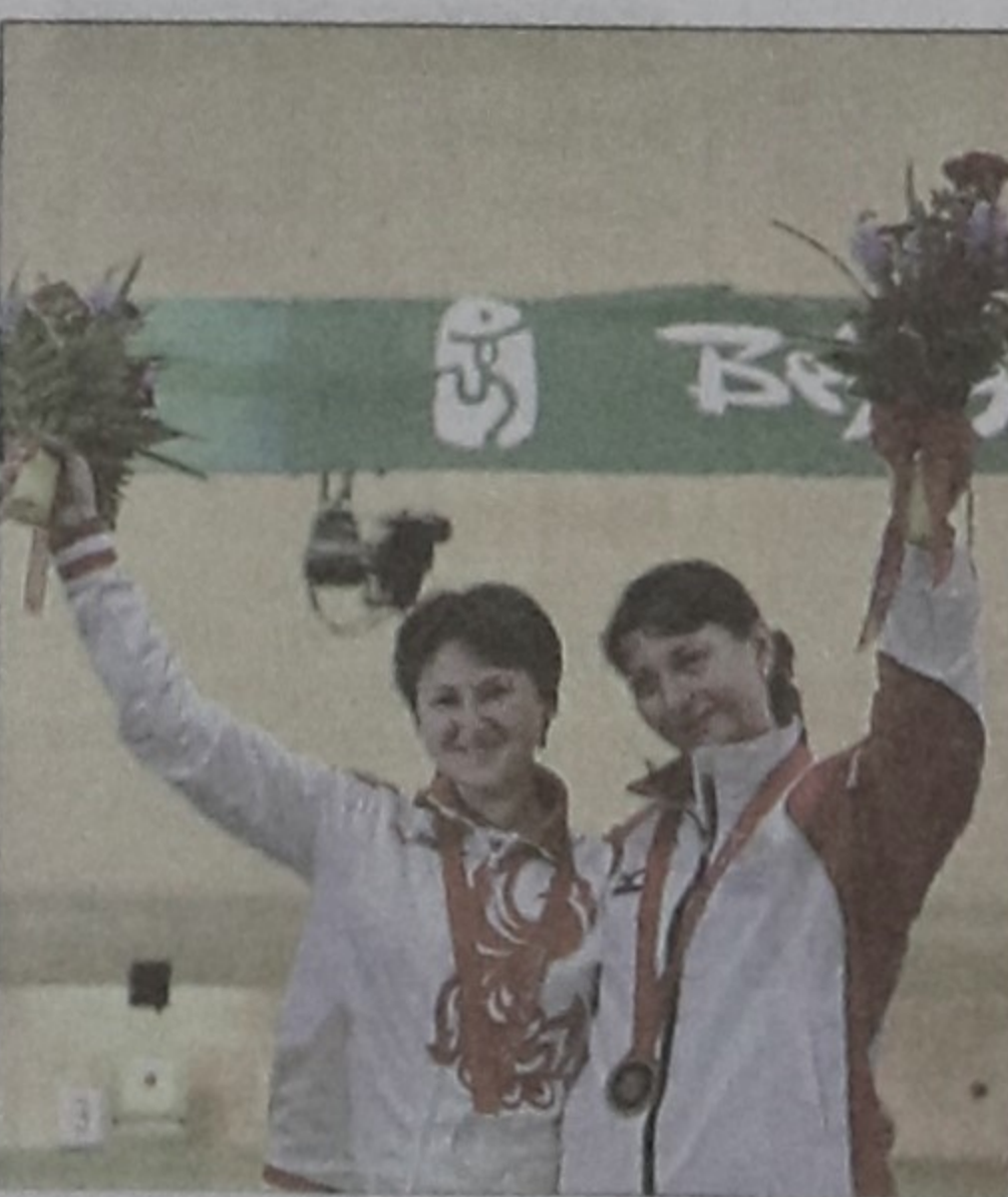
(L) Women's 10-metre air pistol silver medalist Natalia Paderina from Russia (L) holds bronze medalist Nino Salukvadze of Georgia on the podium at the Beijing Shooting Hall while (R) US swimmer Michael Phelps strokes his way to winning the men's 400m individual medley gold with a world record timing at Beijing's National Aquatics Centre in the 2008 Olympic Games on Sunday.