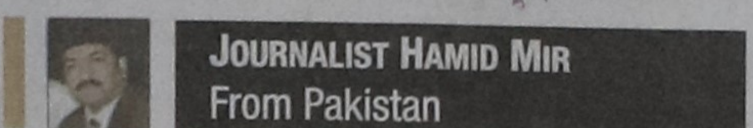
JOURNALIST HAMID MIR From Pakistan