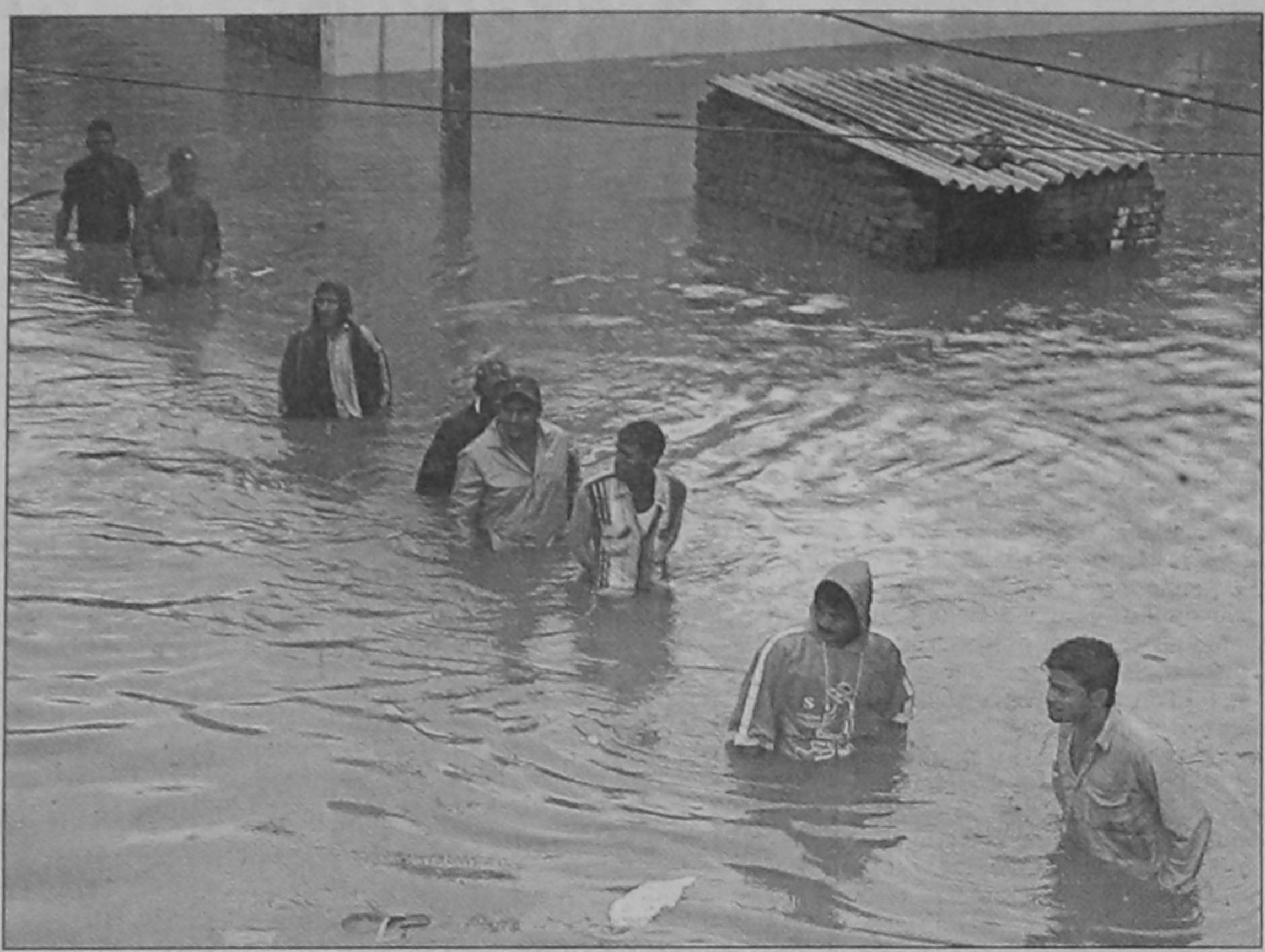
Indian people walk through flooded streets as several low-lying residential areas go under water in Hyderabad yesterday. Torrential rains lashed the twin cities of Hyderabad and Secunderabad and some other districts of the southern Andhra Pradesh due to the depression in the Bay of Bengal.