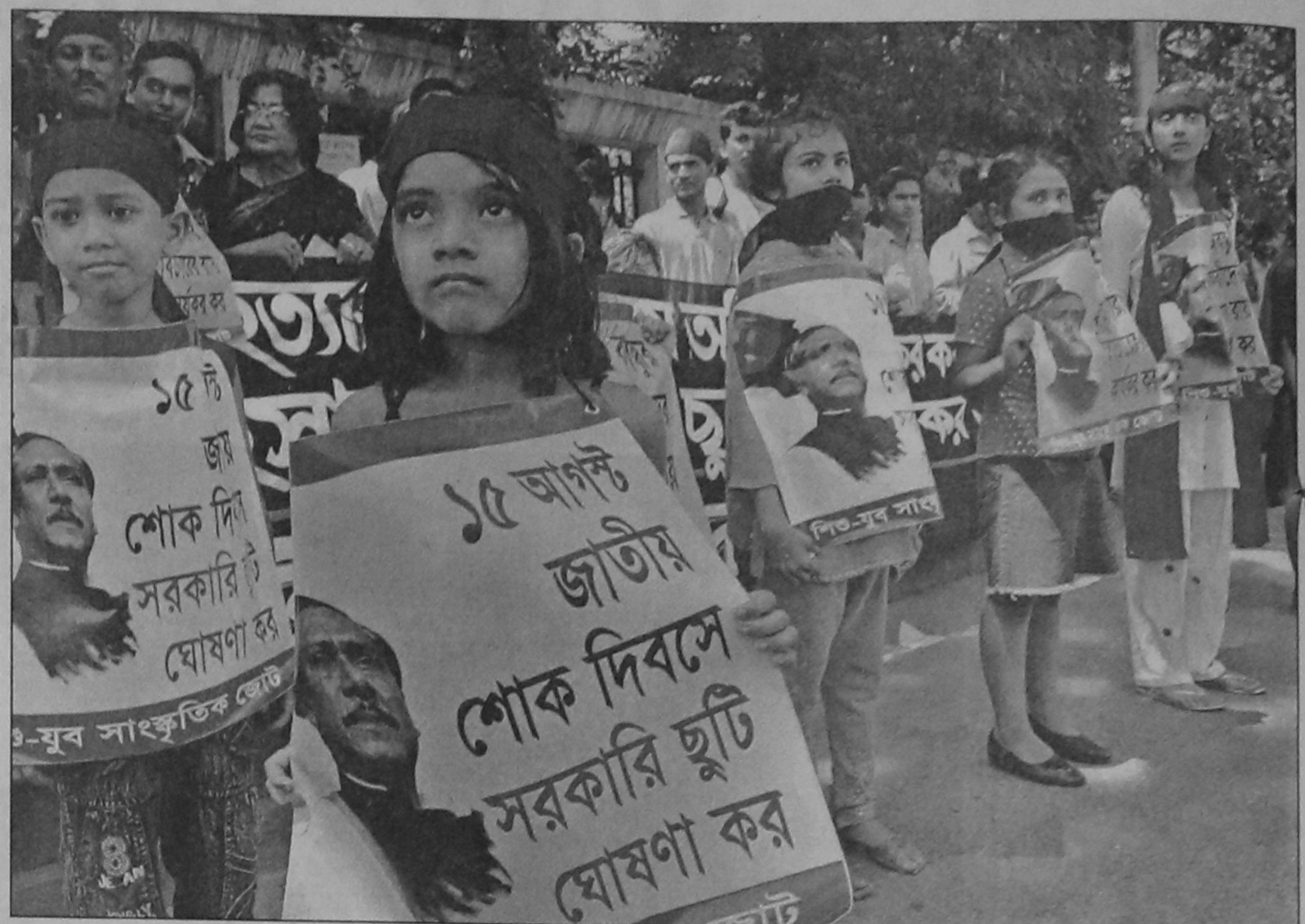
Shishu Jubo Sangskritik Jote forms a human chain in front of National Press Club in the city yesterday demanding declaration of August 15 as the national mourning day and public holiday.

The 71-member executive committee was sworn in on Thursday.