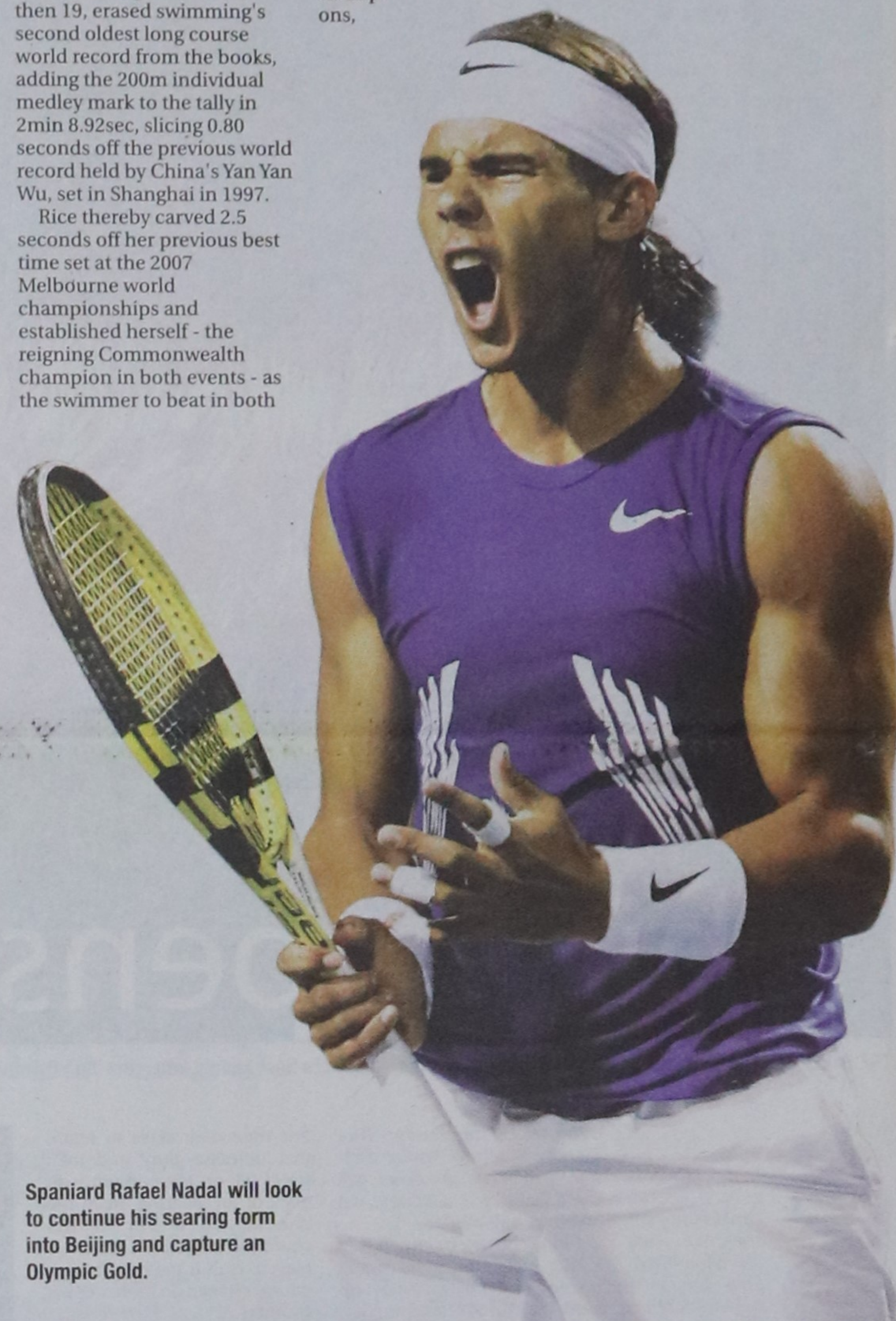
Spaniard Rafael Nadal will look to continue his searing form into Beijing and capture an Olympic Gold.