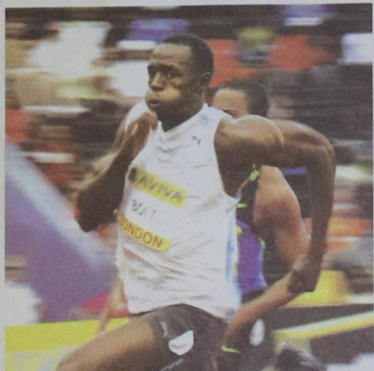
Usain 'The Lightning' Bolt will look to strike fast and hard this summer.