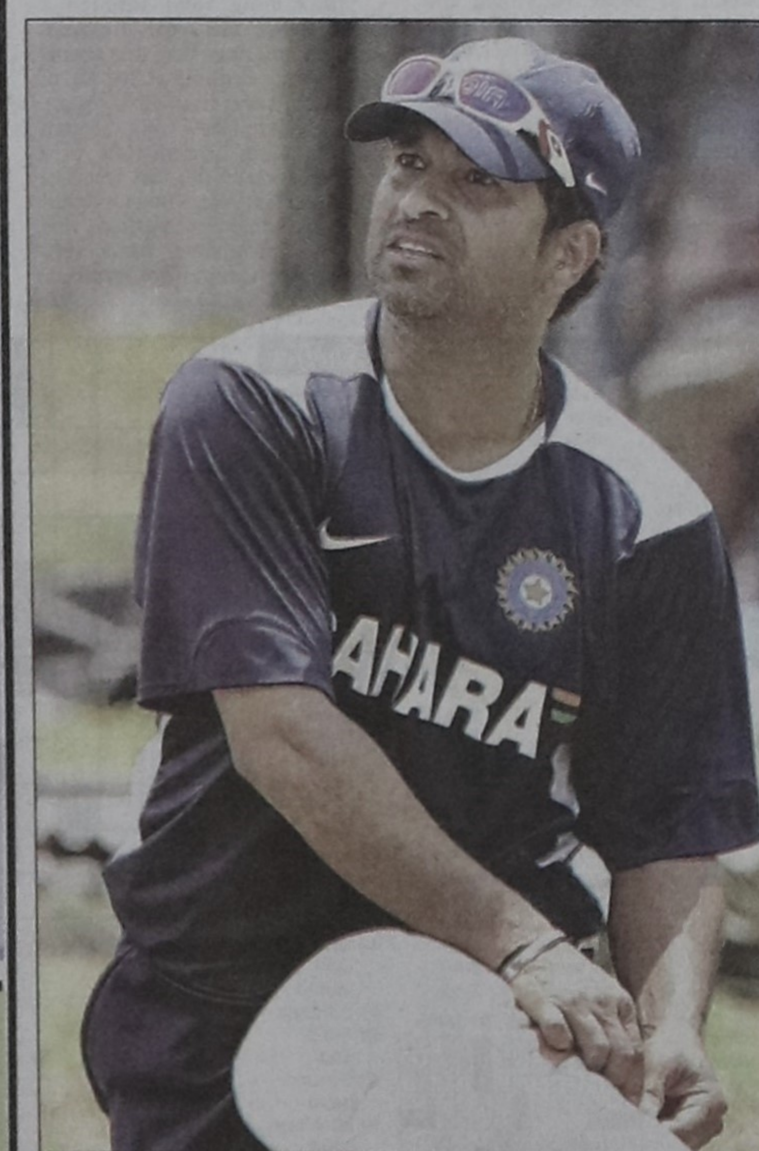
India superstar Sachin Tendulkar puts on his pads before batting during a practice session at the P Sara Stadium in Colombo yesterday ahead of the third Test that starts today. Tendulkar is 97 runs shy of surpassing West Indies great Brian Lara as Test cricketers leading scorer.