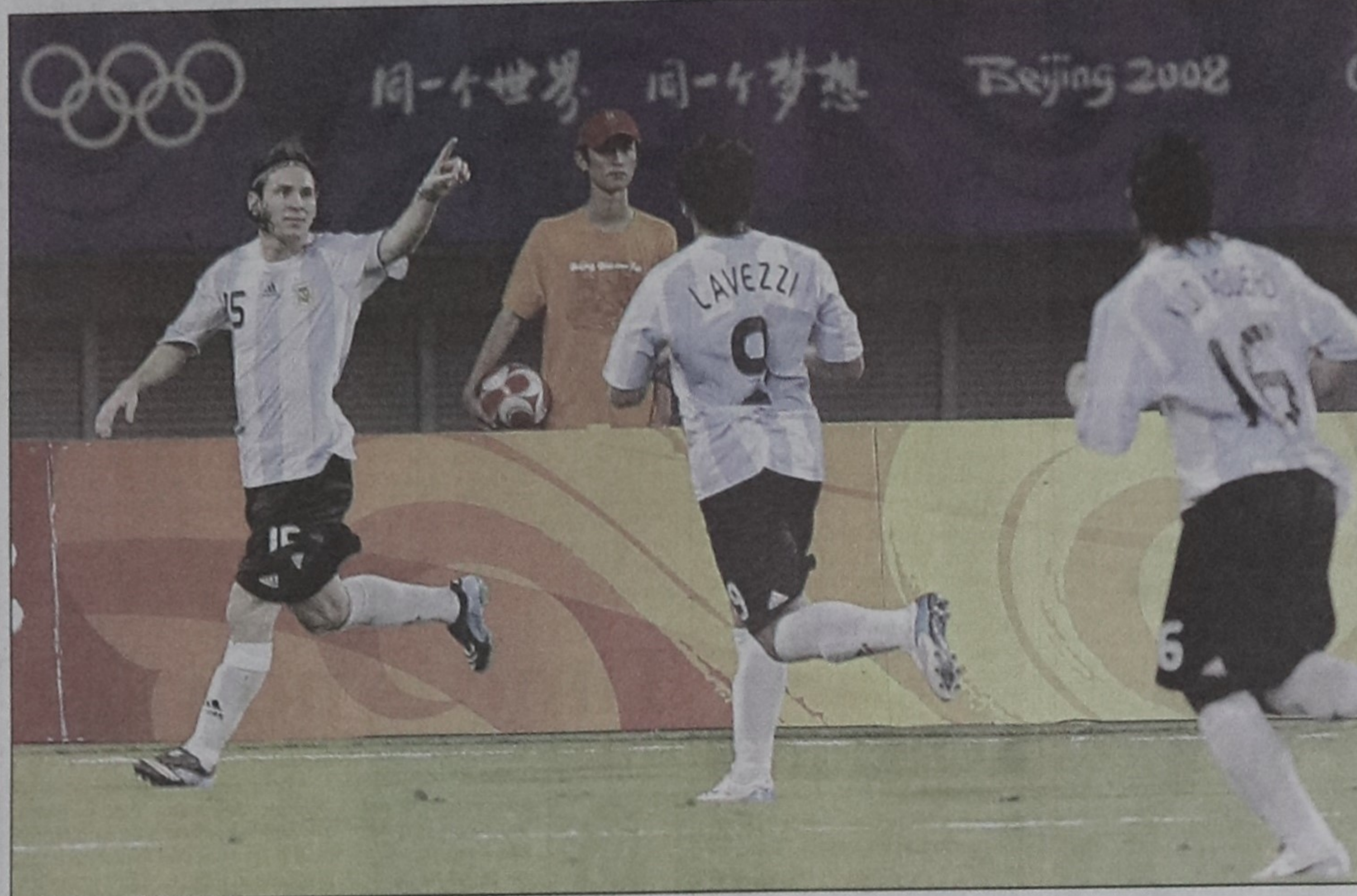
HE PLAYS AND SCORES: Argentina star Lionel Messi (L), subject of a heated club-country row, runs off after scoring against Ivory Coast during their opening match of the Olympics at the Shanghai Stadium yesterday.

Citycell Federation Cup Mukjibdaha v Wanderers (5pm) Farashganj v Khulna Abahani (7pm)