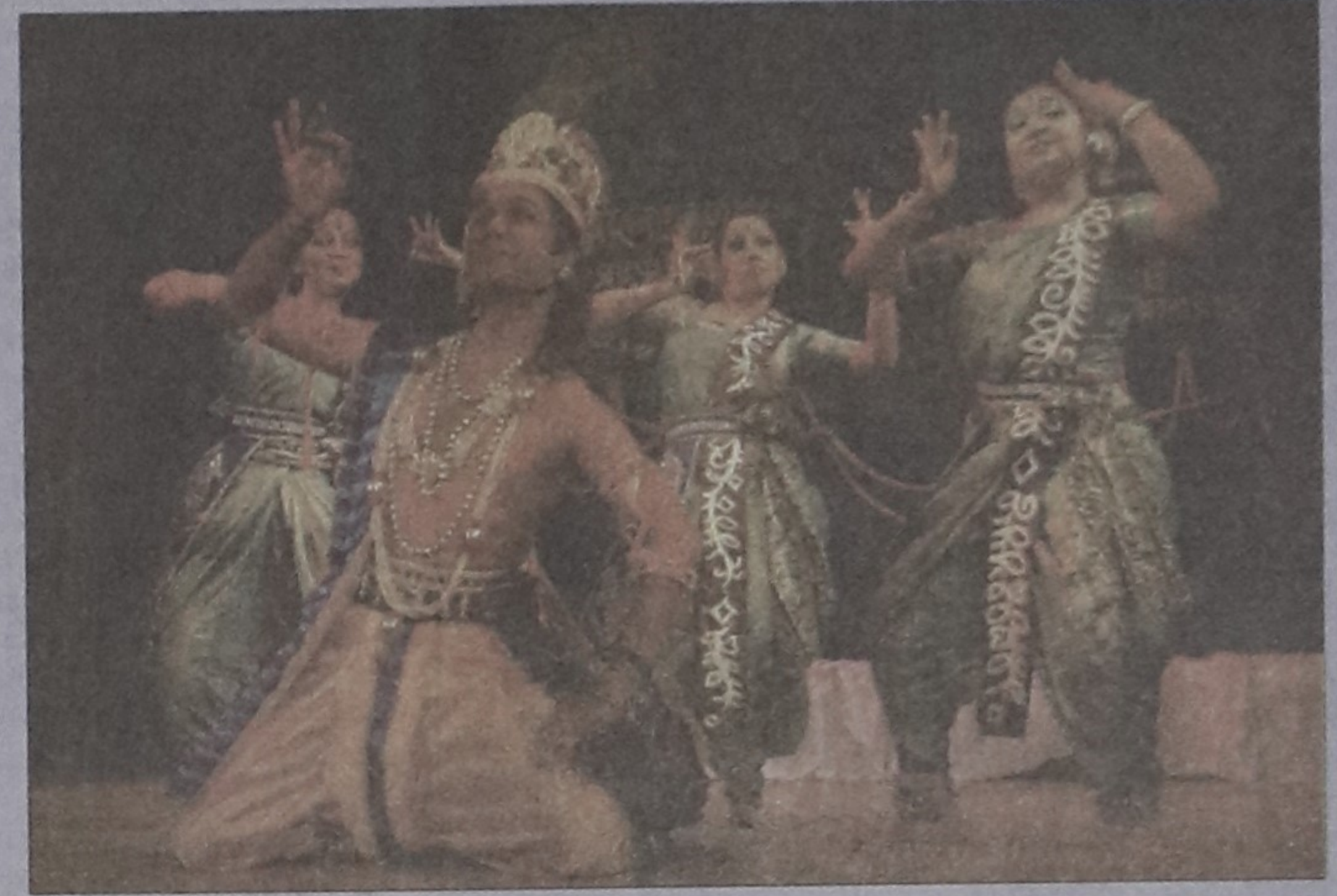
Artistes perform a group dance.