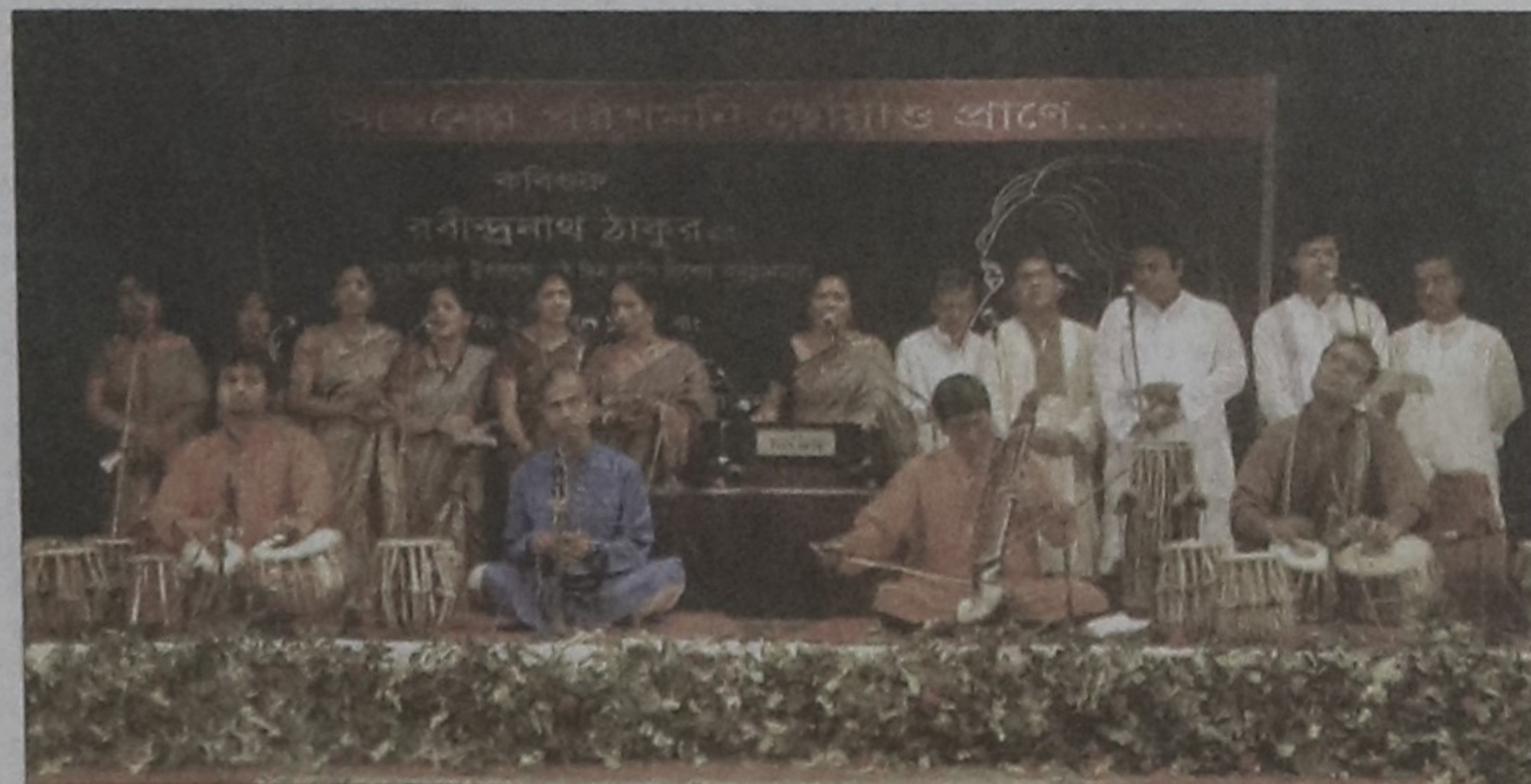
A group rendition by artistes of Geetanjali.