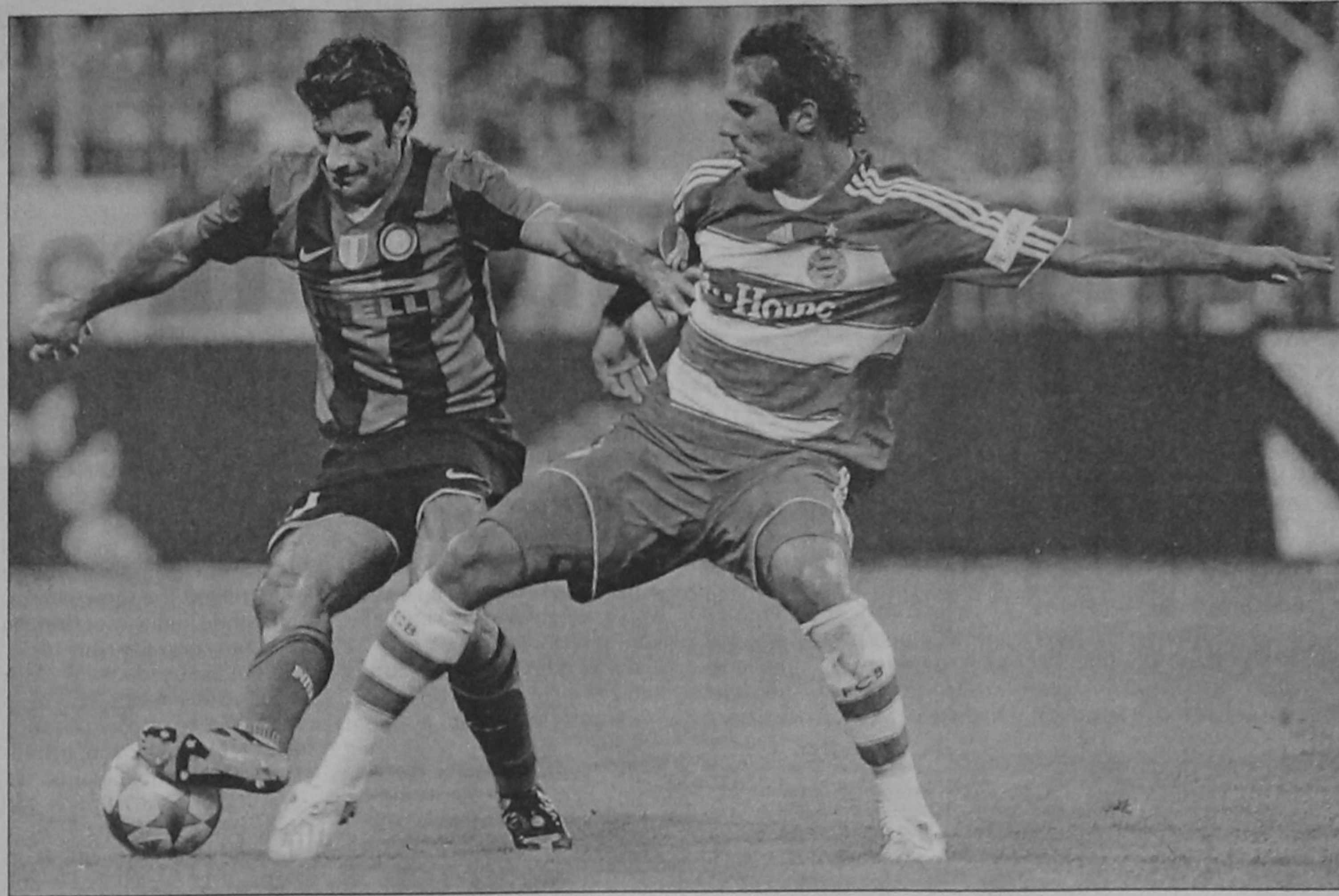
Bayern Munich midfielder Hamit Altintop (R) challenges Inter Milan star Luis Figo during their friendly match at the Olympic Stadium in Munich on Tuesday. Inter won 1-0.

Brazil open their campaign against Belgium in Shenyang.