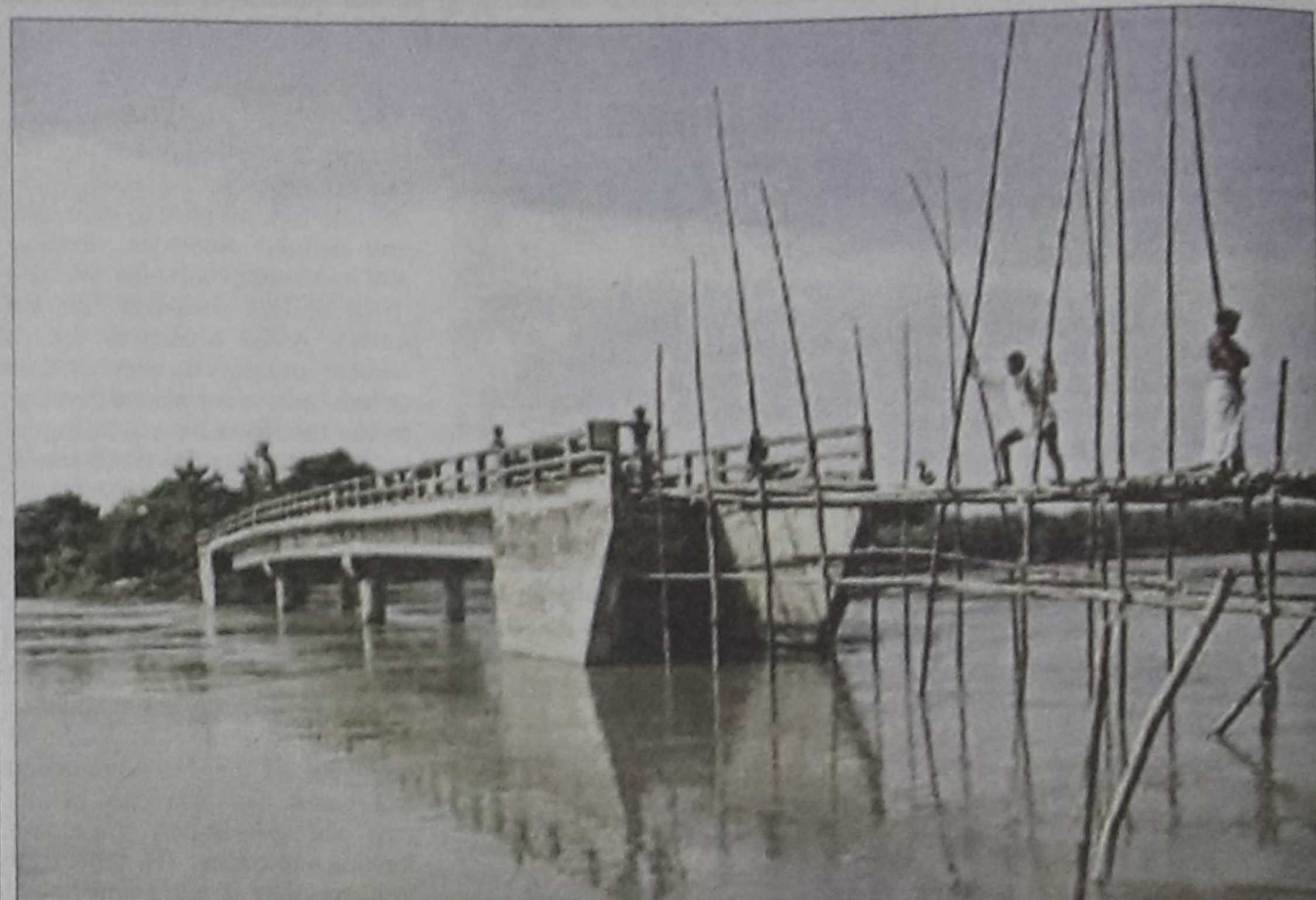
PUBLIC MONEY DOWN THE DRAIN: Failing to complete the approach road in dry season, the LGED has sanctioned Tk 2 lakh without any tender for building a bamboo-made link to connect the bridge at Karirhat on Dharmakura-Mahmudpur road in Jamalpur district.

"The election result has already raised question on the justification of the graft cases against Kamran. It is also a mes-