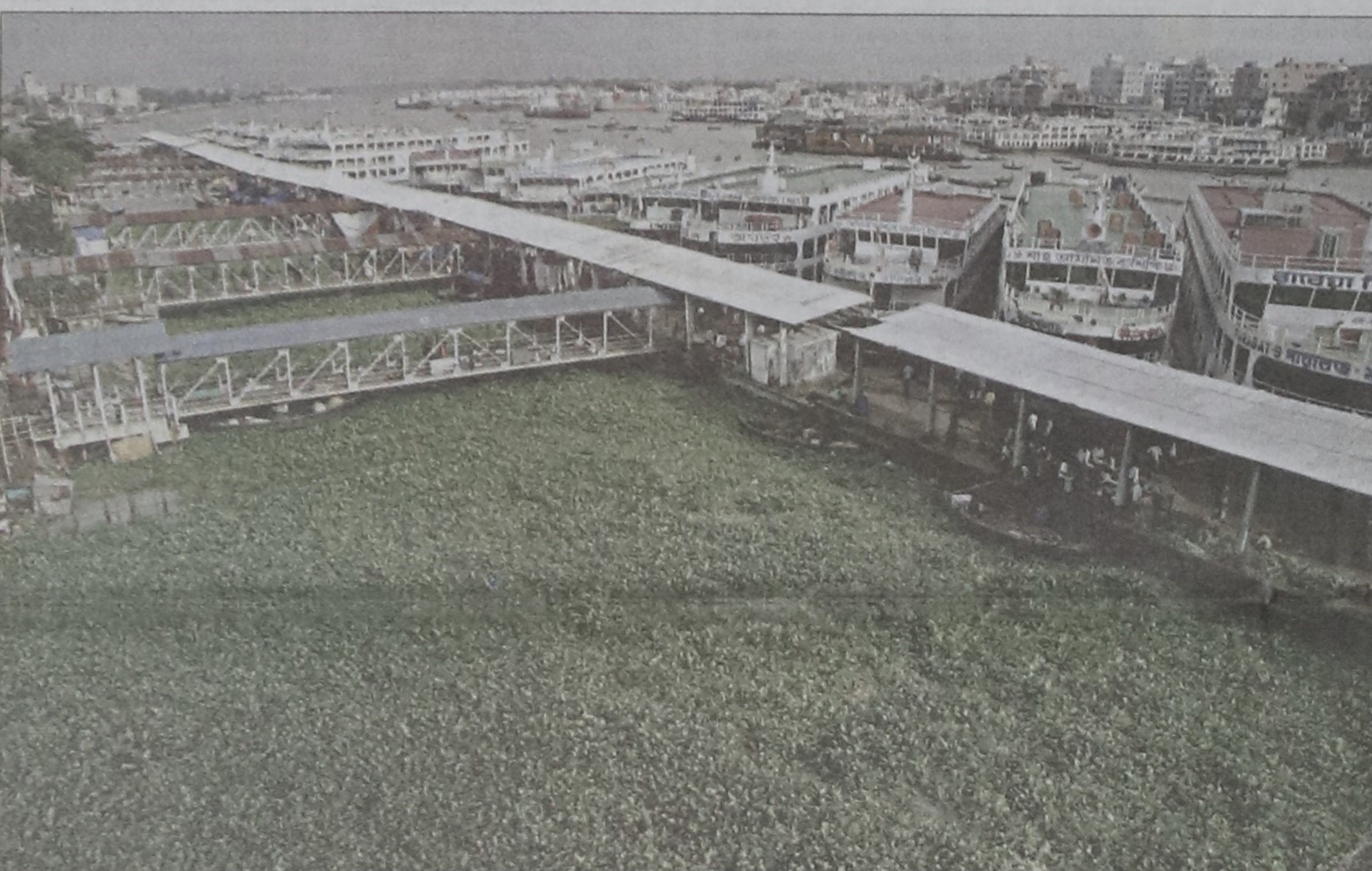
A large area of Sadarghat Launch Terminal has been covered with water hyacinth for weeks but the authorities are yet to make any move. The photo was taken yesterday.