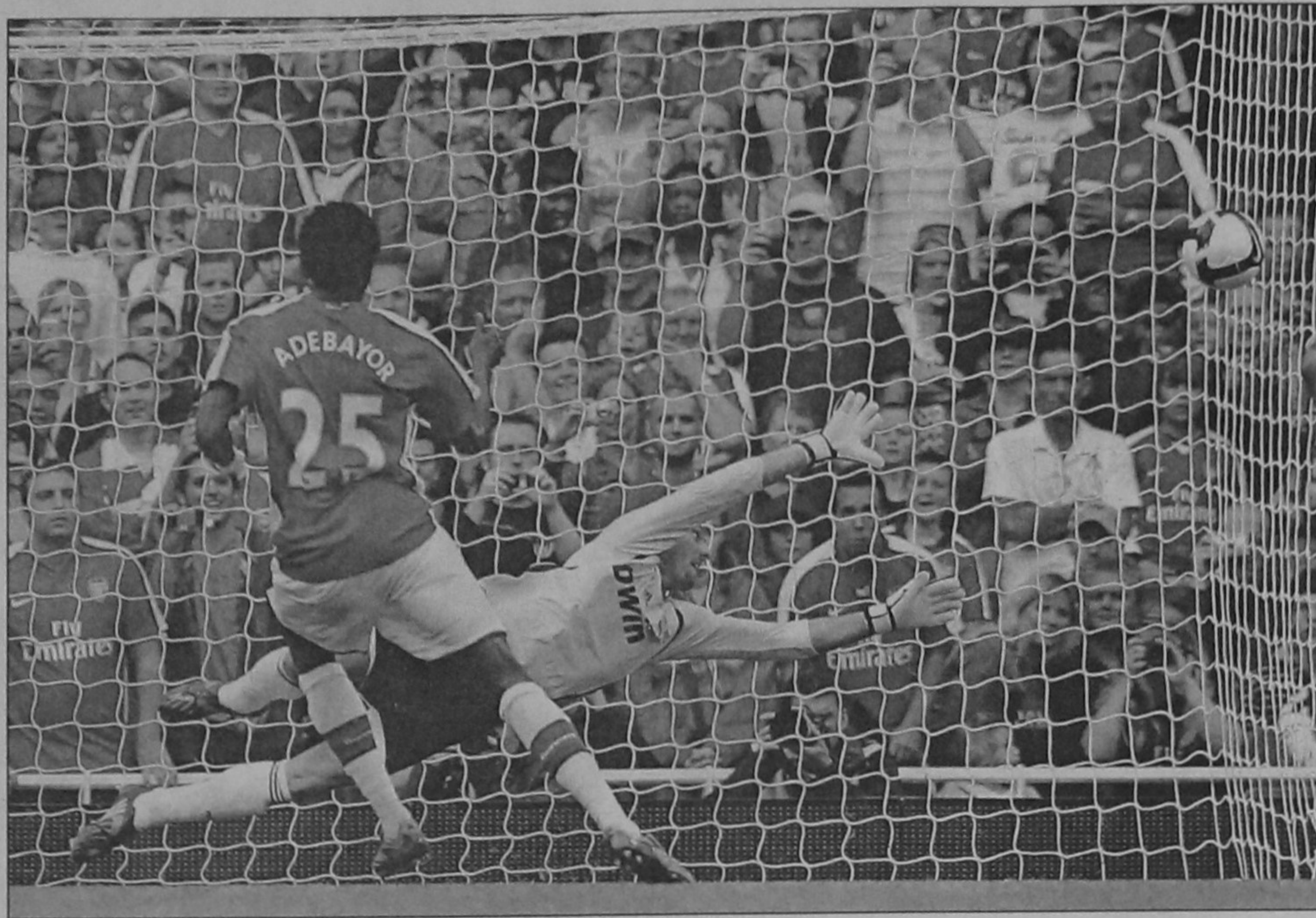
Arsenal star Emmanuel Adebayor places his penalty beyond the despairing reach of Real Madrid goalkeeper Jerzy Dudek to score the only goal of the game during the pre-season Emirates Cup at the Emirates Stadium in London on Sunday.

Ashley, also a billionaire, controls about 70 percent of British biggest sporting goods retailer Sports Direct.