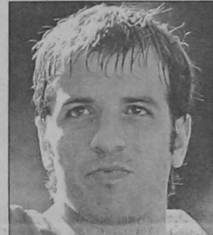
VAN DER VAART

Madrid it's a dream come true. Tomorrow afternoon I will be presented."