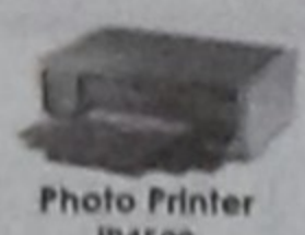
Photo Printer IP4500