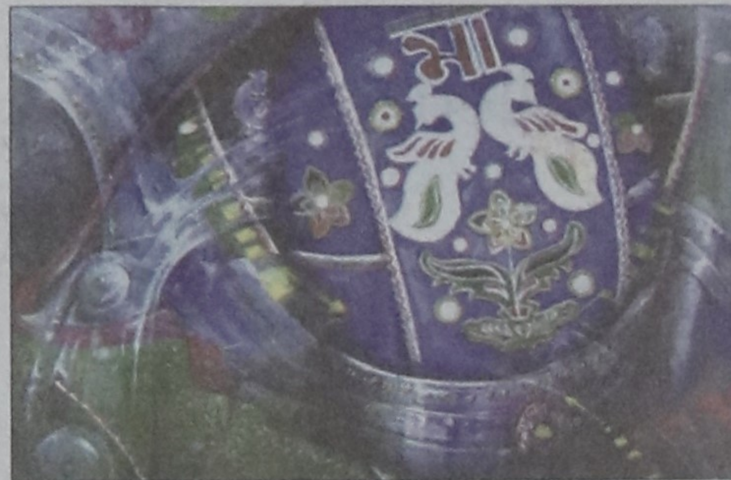
Artworks by Subrata Das.

bewildering. This does not mean that Subrata's paintings are ugly or frightening. In some of the paintings the brushes appear to gently sway and curl although they are monstrous and have impossible, frightening features of giants, ghosts and spirits of the wild, with disturbing representations of hands and feet. At times the