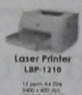
Laser Printer LBP1210