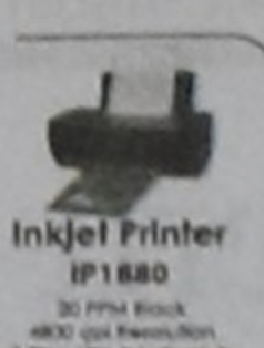
Inkjet Printer IP1880

13/1 Fatema Arcade (2nd floor), Road No-5, Dhanmondi R/A, Dhaka-1205 Tel: 9664101, 9668001, 8611444 Fax: 880-2-8610410 E-mail: jan-mat@global-bd.net