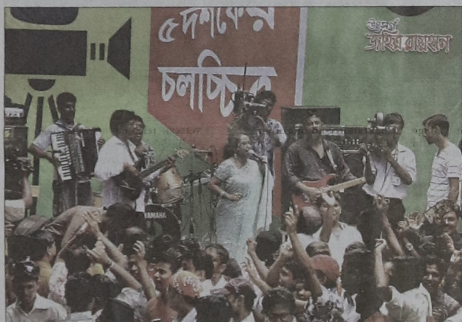
Eminent playback singer Abida Sultana performs at the programme.