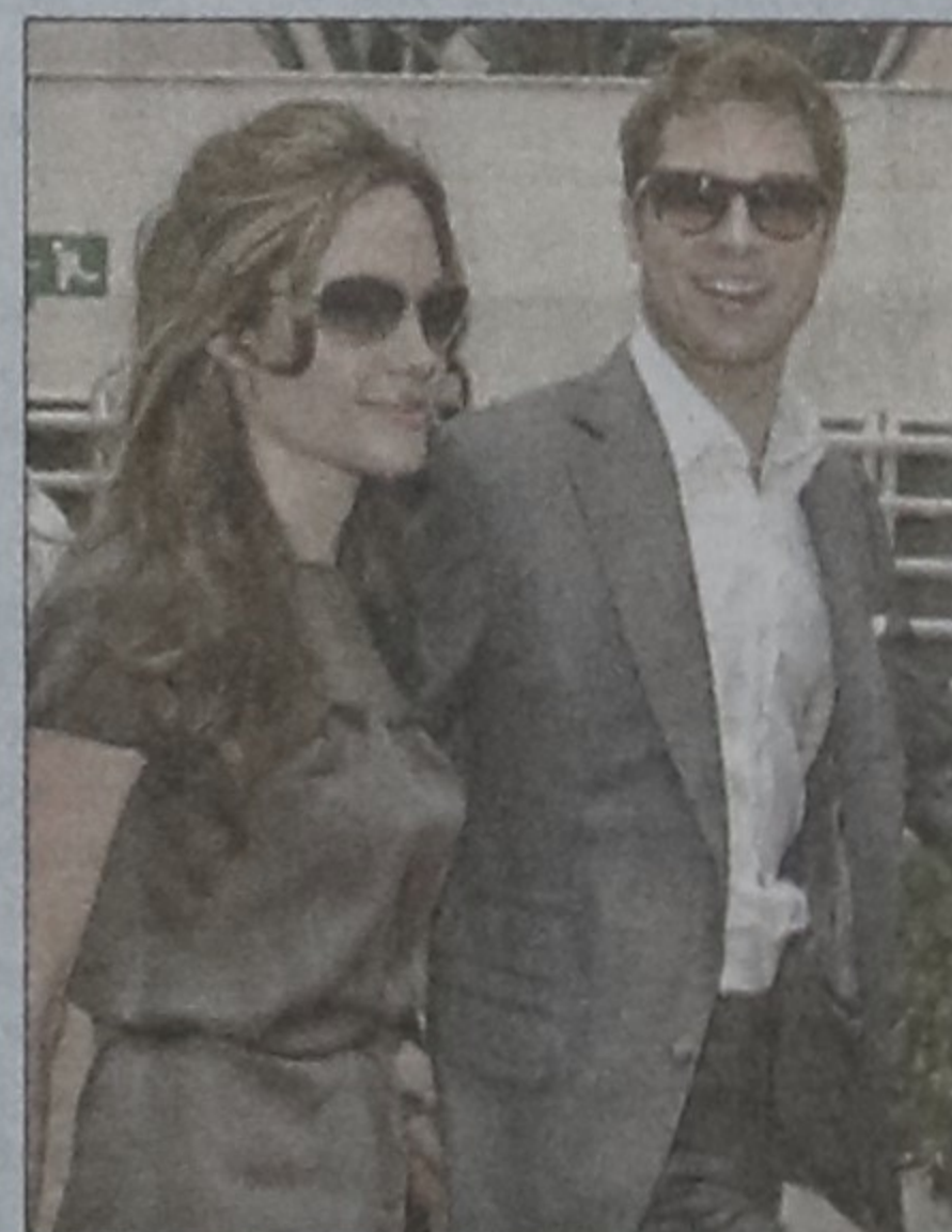
Jolie and Pitt have six children