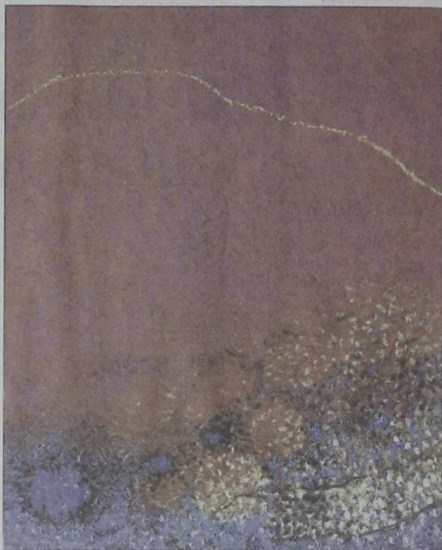
Oil painting by Nipa

Designs and textures are seen in Nipa's paintings. As she piles colours upon colours. Her preoccupations are colours and sur-