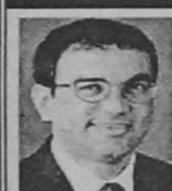
M. Joomratty Barrister & Solicitor Id No: 503112

CANADA's Immigration System has been changed. Priorities applicants will get decision within 6-12 months. The new law is intended to stop the growth of the backlog of applicants. Please visit our office with updated CV for more details.