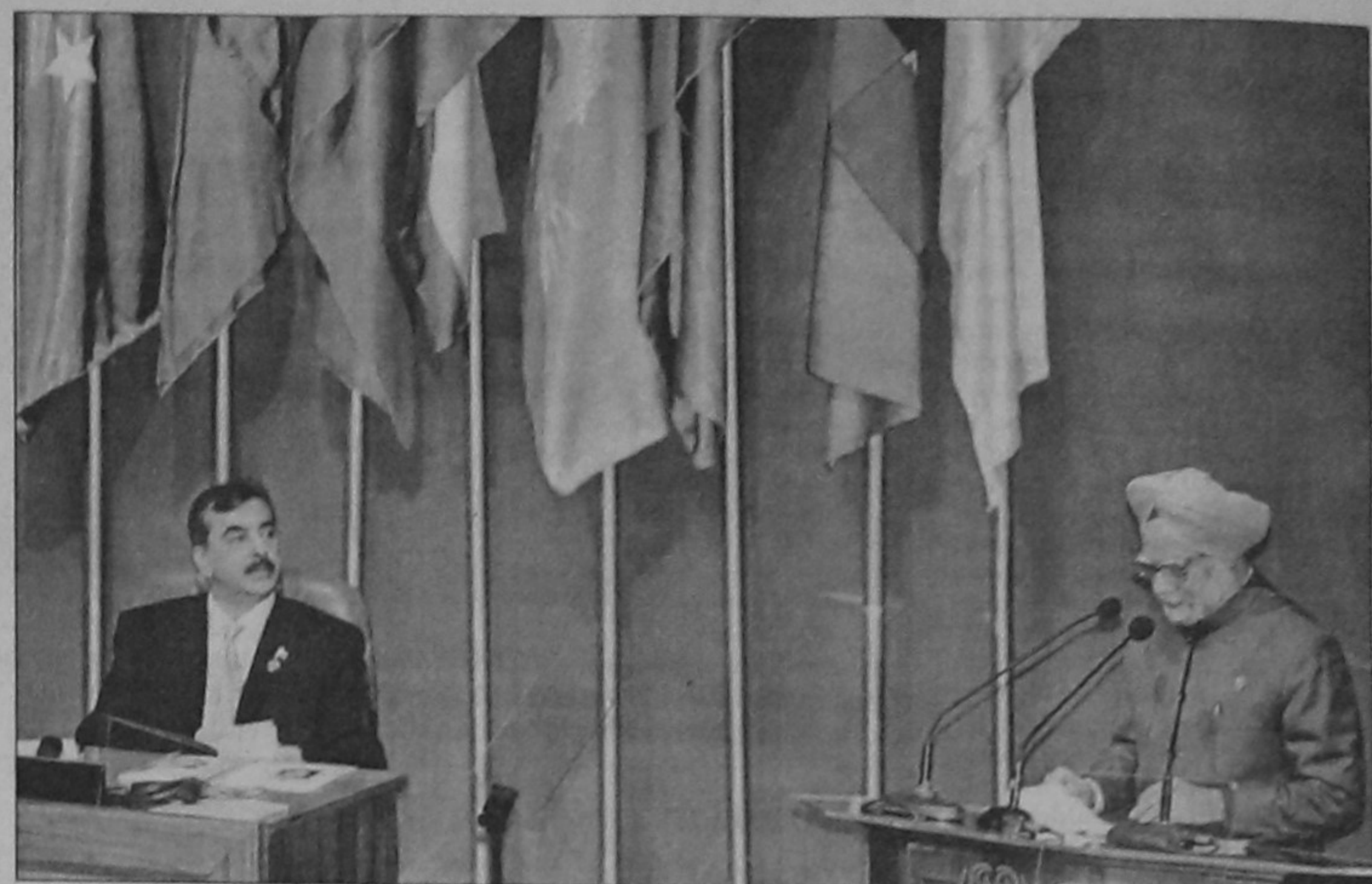
Indian Prime Minister Manmohan Singh (R) deliver his speech as Pakistan Prime Minister Yousuf Raza Gilani looks on during the opening ceremony of the South Asian Association for Regional Cooperation (Saarc) Summit in Colombo yesterday. The Saarc summit opened in Sri Lanka on Saturday with Indo-Pak tensions eclipsing regional talks on trade, terrorism and poverty.

Stating that South-Asia has witnessed the most heinous acts of terrorism in recent times, including the bombing of Indian embassy in Kabul, the Prime Minister said: "the scourge of terrorism must be removed from our midst and criminals and terrorists must never go unpunished." "There can be no economic growth or development without peace and security. We need to take all necessary measures to combat terrorism and trans-national crimes like trafficking of women and children," he told Himal paper.