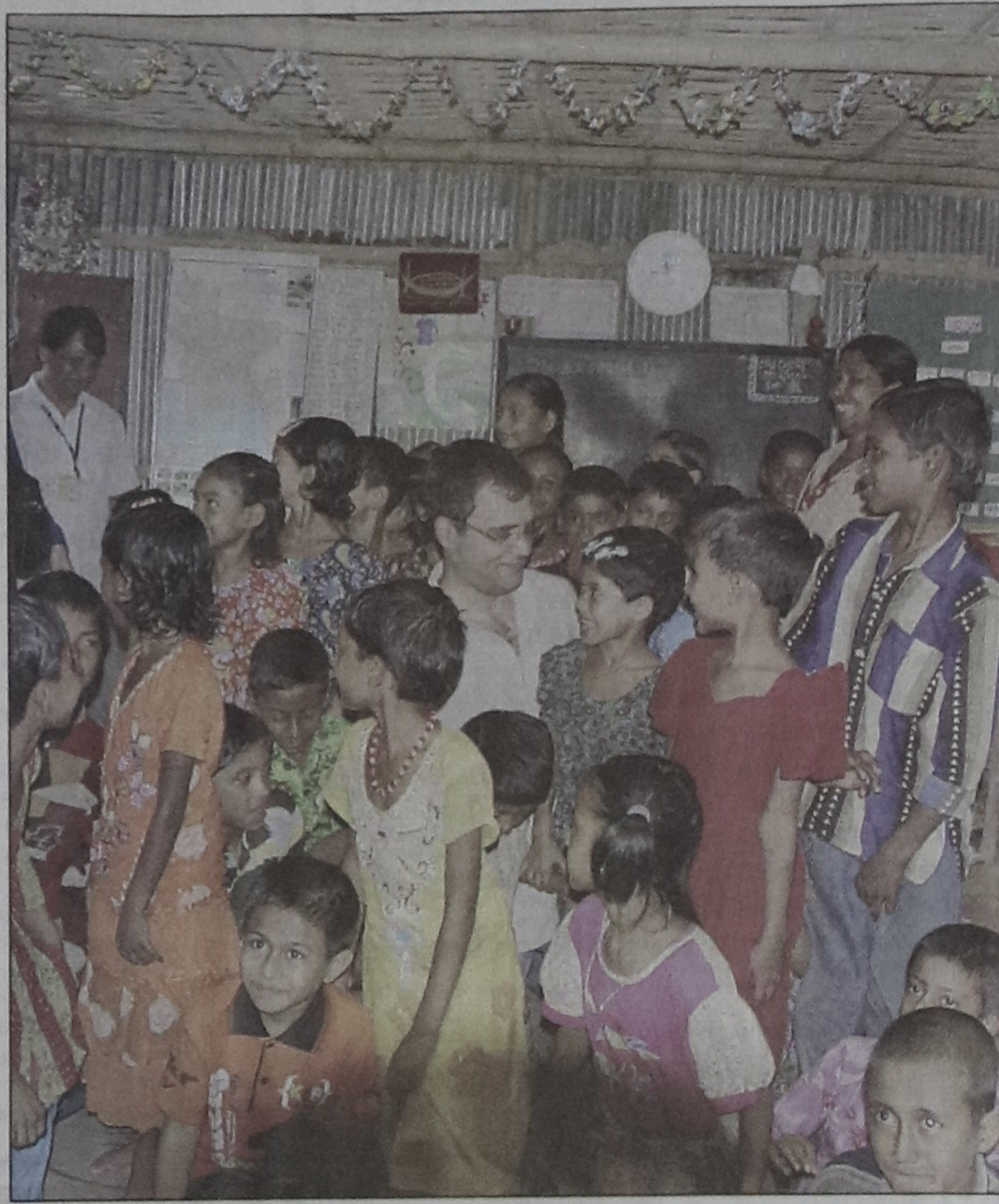
Indian parliament member and Congress leader Rahul Gandhi talks with the students of a primary school of Brac at Kapasia in Gazipur yesterday.

Rahul will leave Dhaka on Tuesday morning.