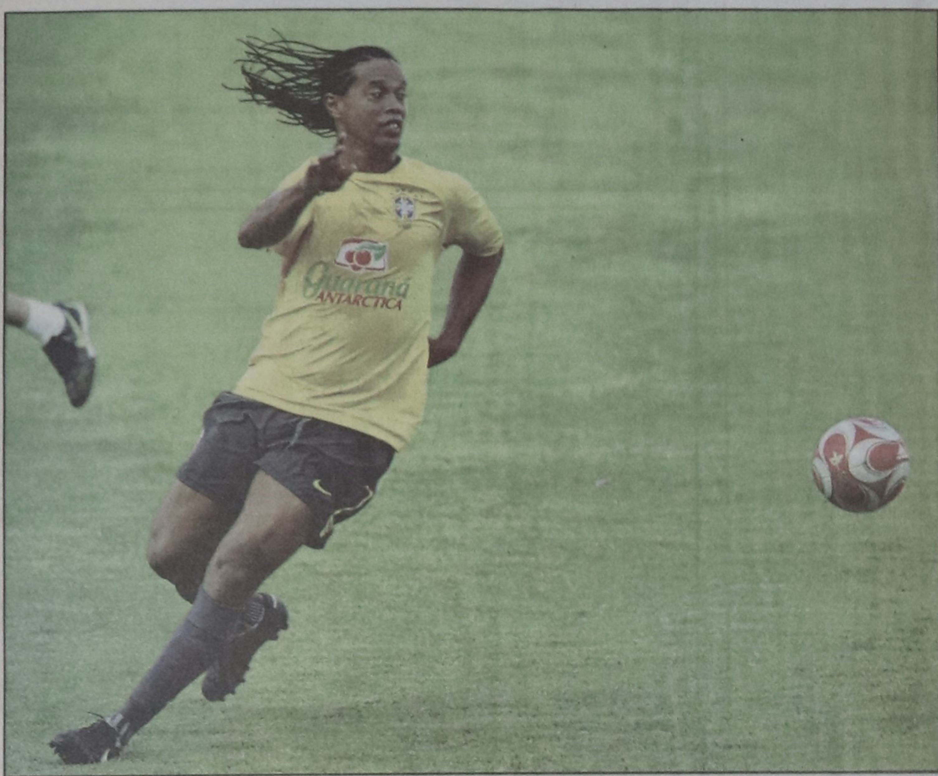
Brazil star Ronaldinho warms up during a training session at Hanoi's My Dinh Stadium on Thursday.