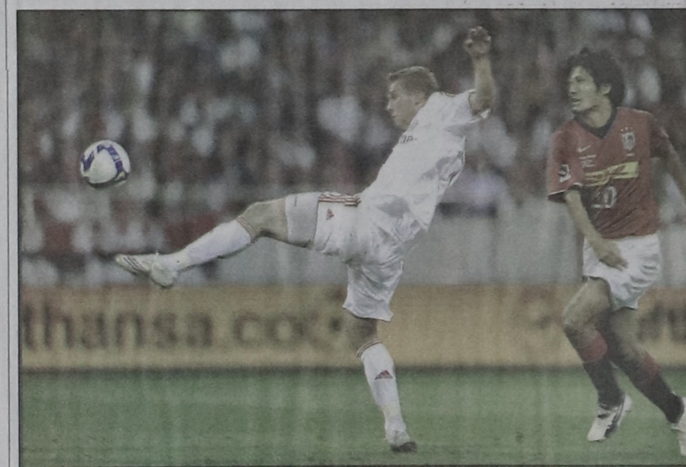
Bayern Munich striker Lukas Podolski (L) scores his first goal during a friendly match against Japan's Urawa Reds at the Saitama Stadium on Thursday. Bayern Munich won 4-2.

He added: "It was difficult to play against a team that held the ball well, moved the ball well and passed the ball well, especially now when we're not quite there yet physically."