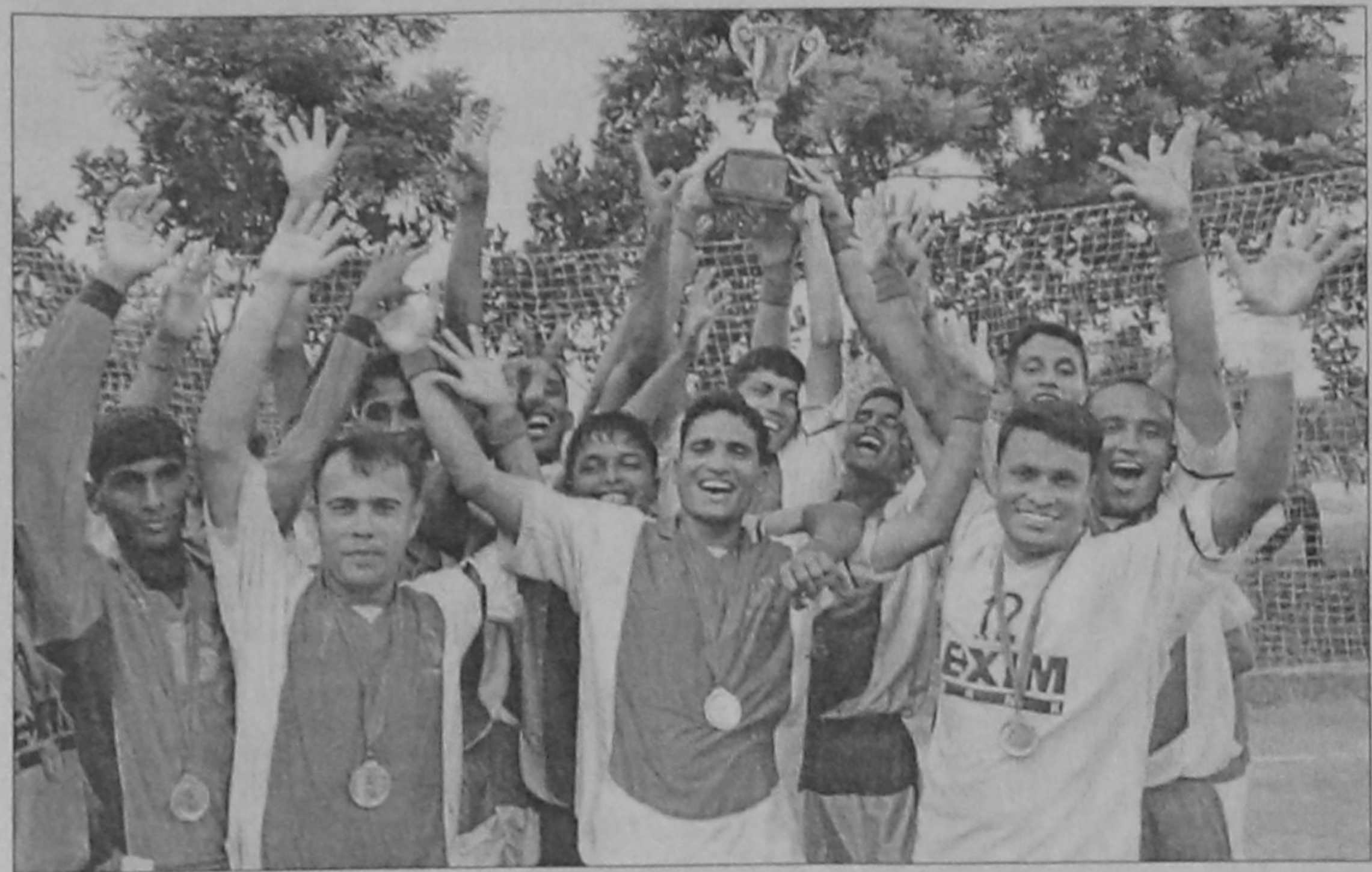
Bangladesh Rifles celebrate after winning the Design Zone 2nd Office Handball League at the Outer Stadium handball court yesterday.