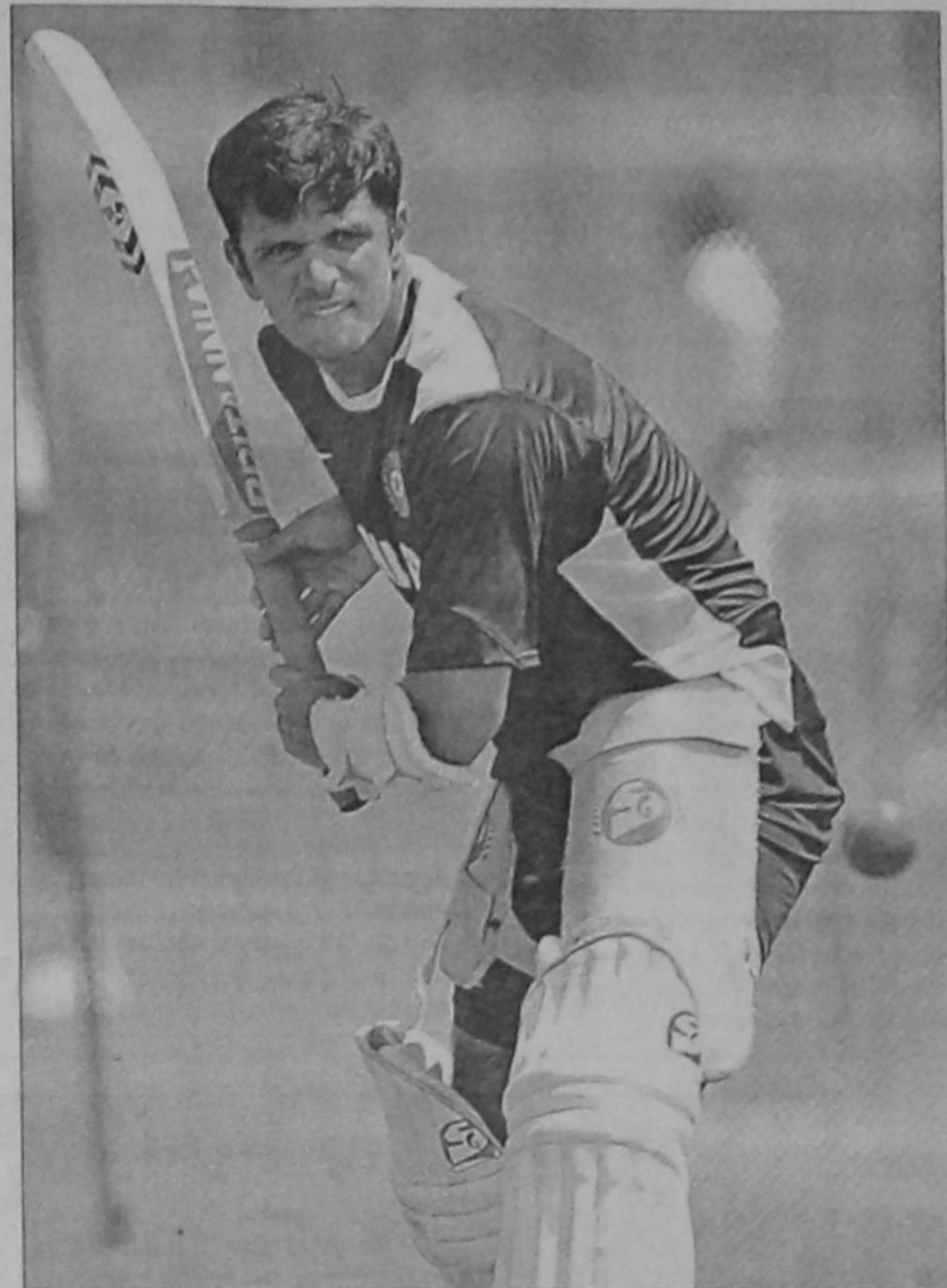
India's dependable batsman Rahul Dravid goes on the front foot during a training session at the Galle International Stadium on Wednesday.

Coming to Sri Lanka and winning was never going to be easy, said Kumble, but the signs shown in the past four days led him to believe they were hungry to prove they could win. He also said he had