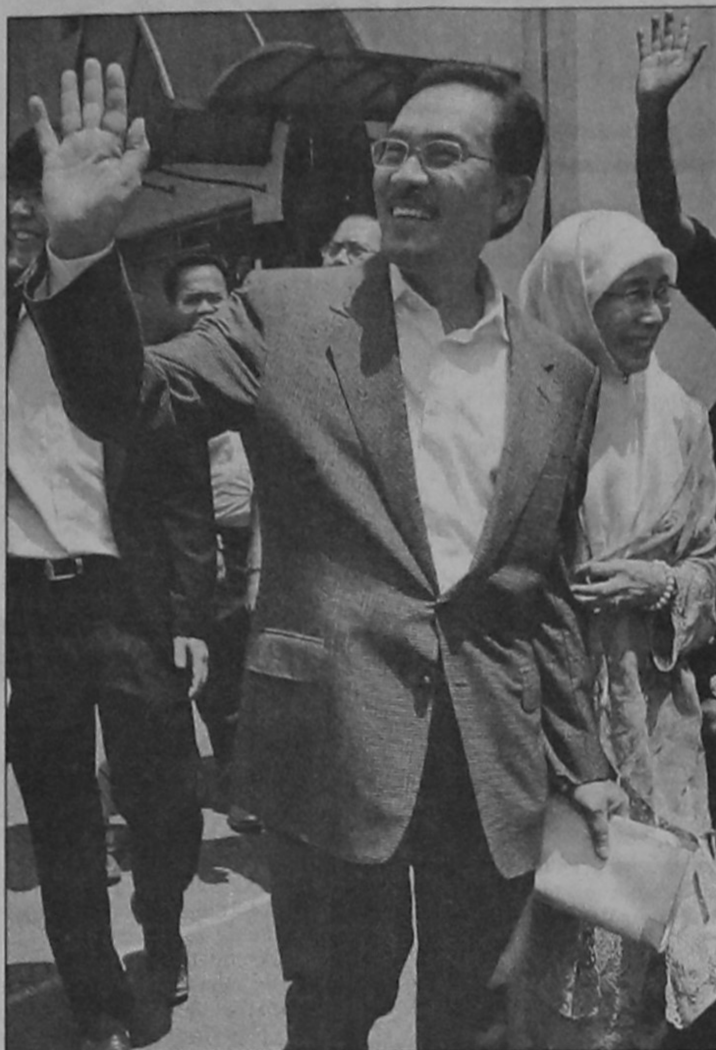
Malaysia opposition leader Anwar Ibrahim (L) walks with his wife Wan Azizah (R) as they leave the Islamic Shariah Court and Enforcement office in Kuala Lumpur yesterday. Malaysia's opposition figurehead Anwar Ibrahim said he will contest in the by election later this year and form a new government despite fears that he may be charged for sodomy.

Anwar, a former deputy premier who was sacked in 1998 before being jailed on sodomy and corruption charges, has said he plans to return to parliament later this year if a court orders a by-election near his home town.