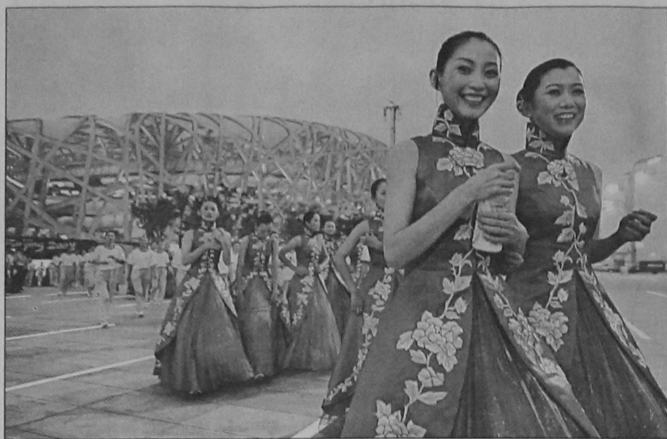
Chinese performers leave the National Stadium which is also known as the "Bird's Nest" for a rehearsal of the Olympic opening ceremony in Beijing yesterday. More than 10,000 performers have been working on the blockbuster 50-minute show for three years but they have all been sworn to secrecy.

Also Tuesday, a roadside blast that apparently targeted an Afghan senator mediating a land dispute in eastern Paktia province killed three policemen and wounded three others, said Ruhollah Samoon, spokesman for the provincial governor.