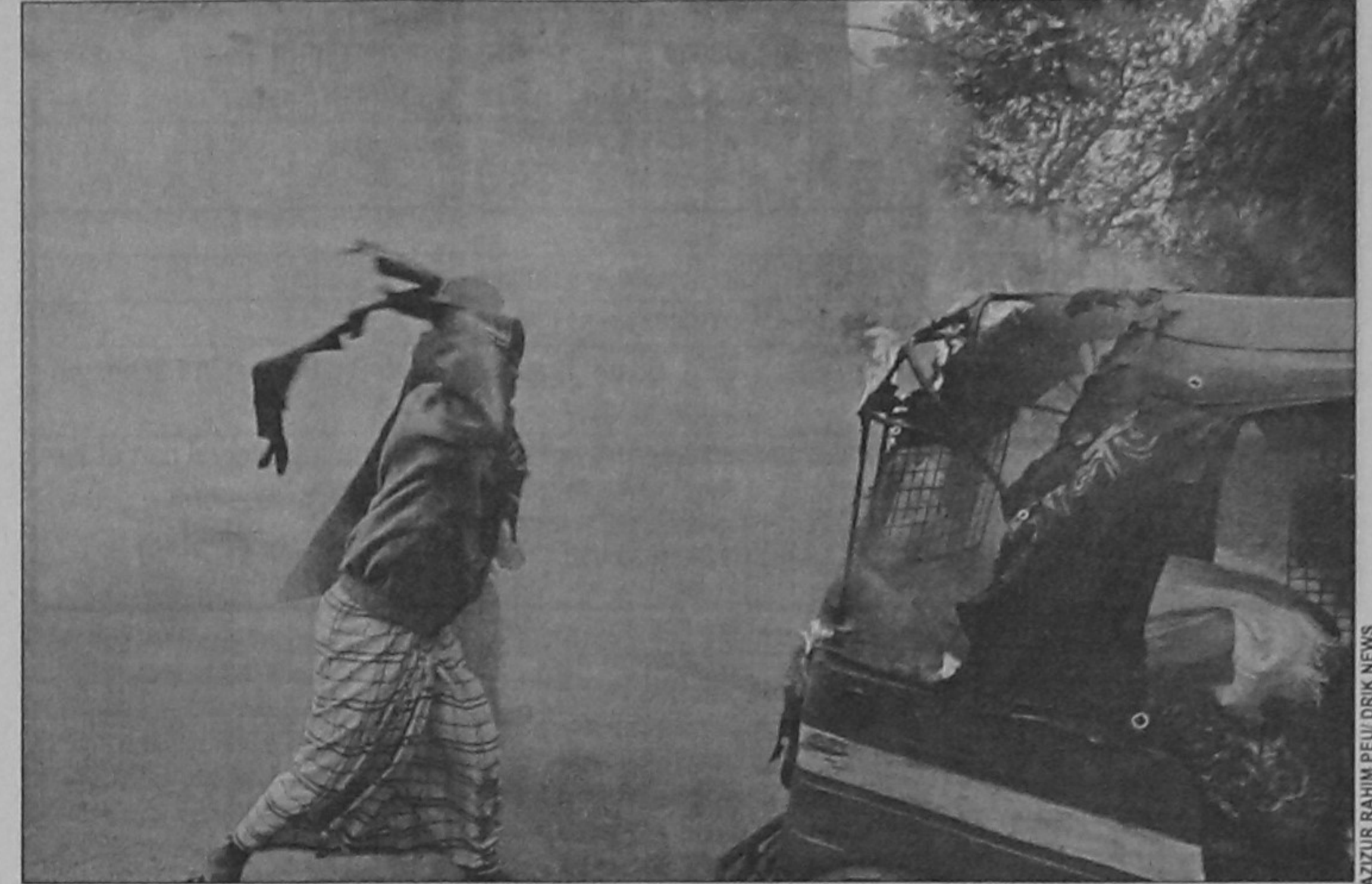
We have come far from those violent days.

Last year on August 15, after placing floral wreaths and paying homage to the great leader at the grave of Bangabandhu at Tungipara in presence of the chiefs of the three services, the Chief Adviser Dr. Fakhruddin Ahmed wrote: "On behalf of the government and myself, I pay my deepest respects to his