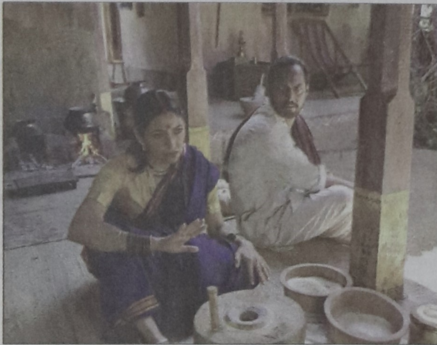
Deepiti Naval (left) and Nana Patekar in a scene from Yatra, a recent Hindi film by Ghose.