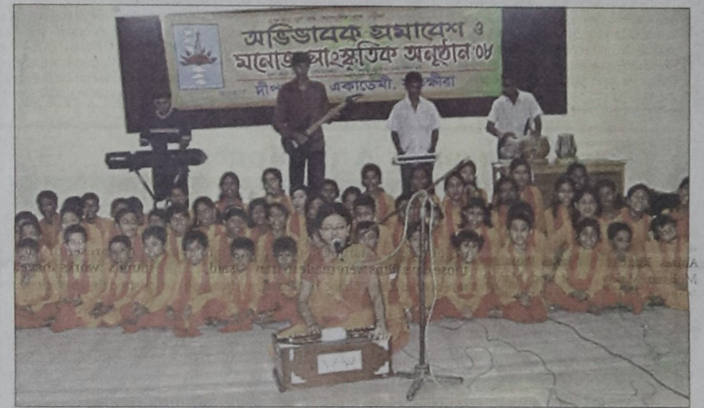
Young students of Dipalok Academy sing in unison

Later, a cultural programme with the participation of students of the Academy was held at the venue. The programme included a medley of recitation, dance and singing.