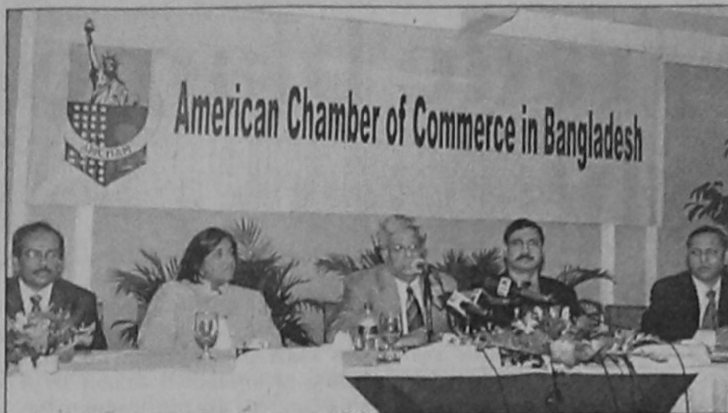
Chief Election Commissioner (CEC) ATM Shamsul Huda speaks at a luncheon meeting of American Chamber of Commerce in Bangladesh (AmCham) at Dhaka Sheraton Hotel yesterday. (Story on Page 1)

The new website address will replace the previous address -- www.ukinbangladesh.org.