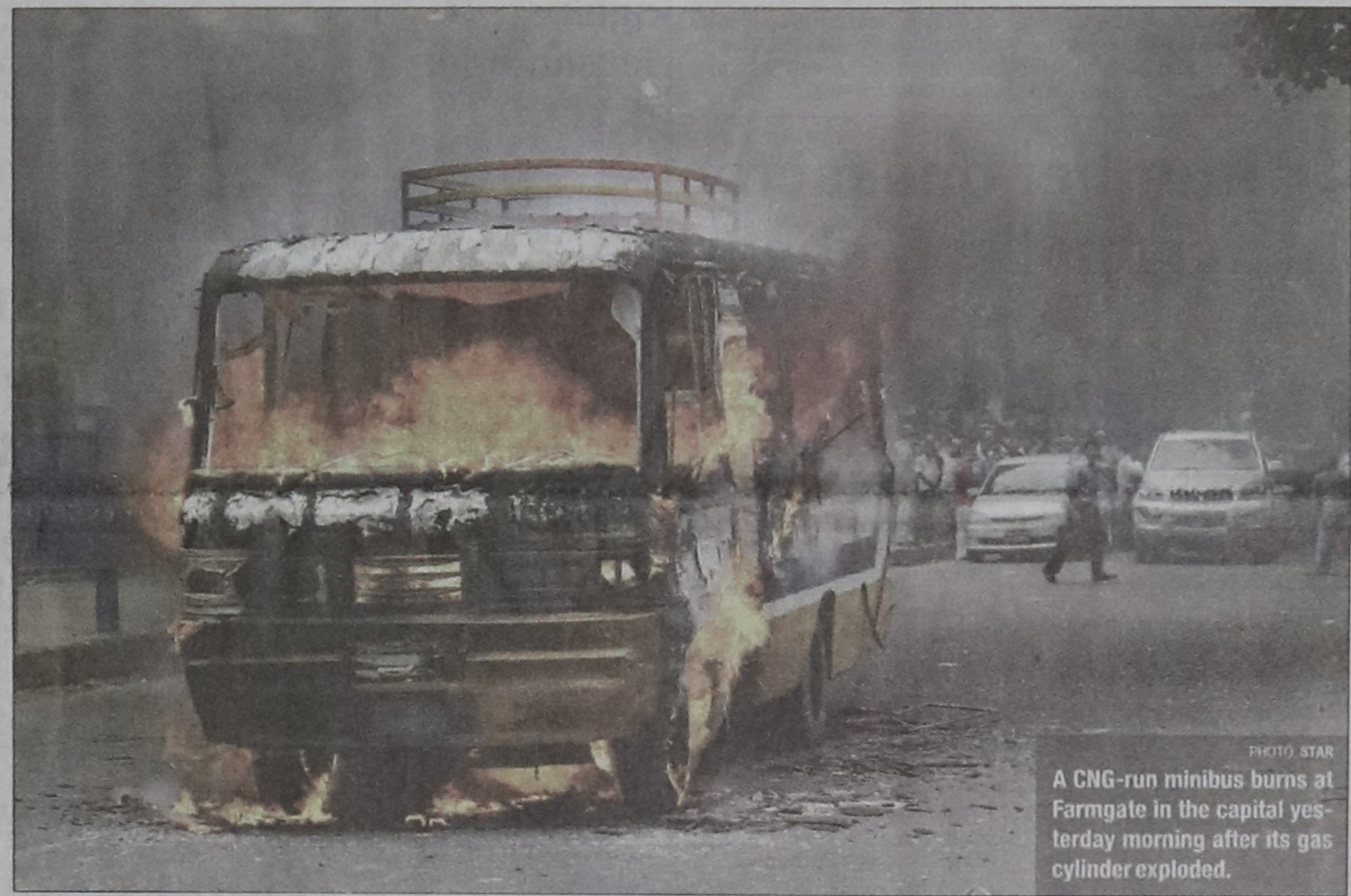
A CNG-run minibus burns at Farmgate in the capital yesterday morning after its gas cylinder exploded.