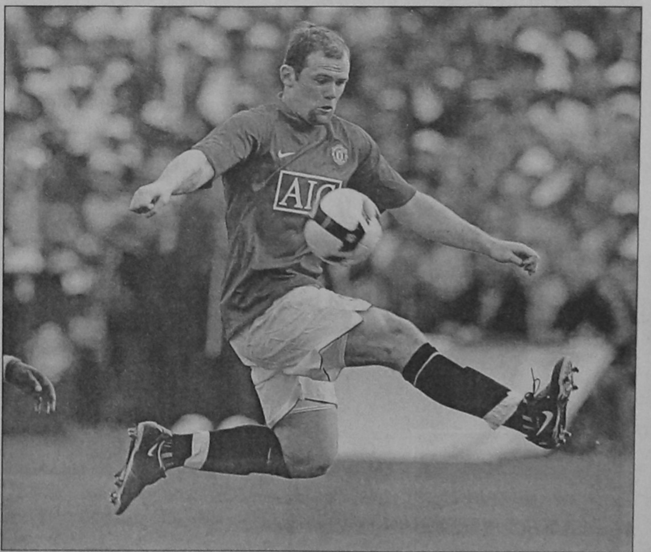
Manchester United star Wayne Rooney intercepts the ball during a friendly match at the Loftus Stadium in Pretoria on Saturday.

"I think he's out for the first match against Portsmouth," Scolari said. "But I have players for this position so it's not a problem for us."