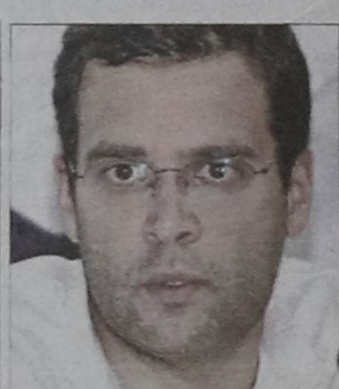
Rahul Gandhi due Aug 1