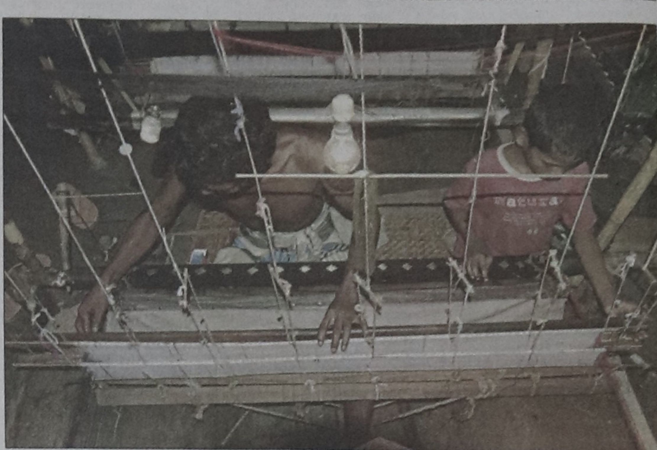
Children work at a Jamdani factory in Rupganj of Narayanganj as poor parents send them to work as weavers to help support their families.