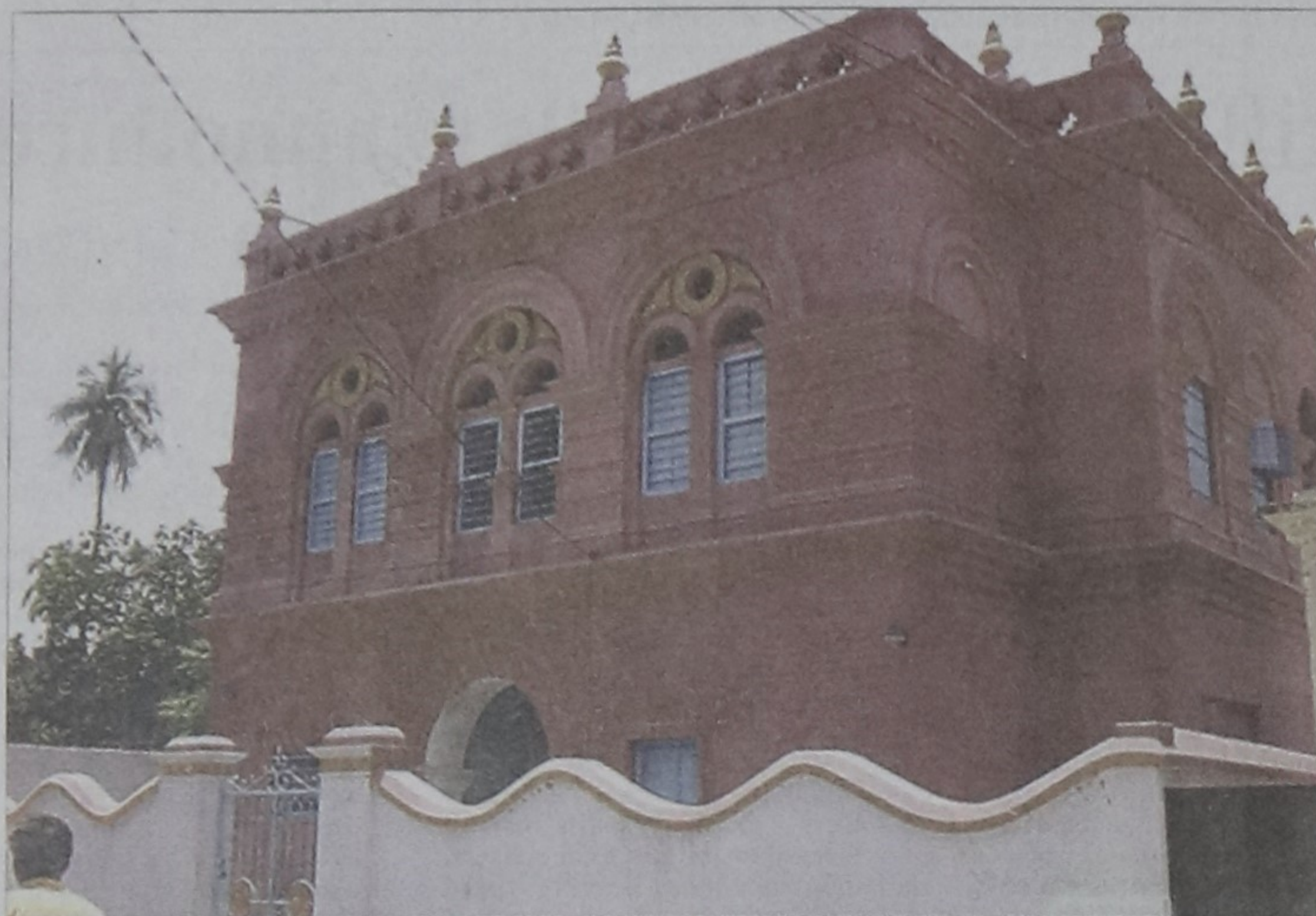
A view of the recently renovated Tagore Lodge

The reconstruction work ended in 2008. In total there are seven rooms are in the two-storied building. The ground floor houses the museum and library and the first