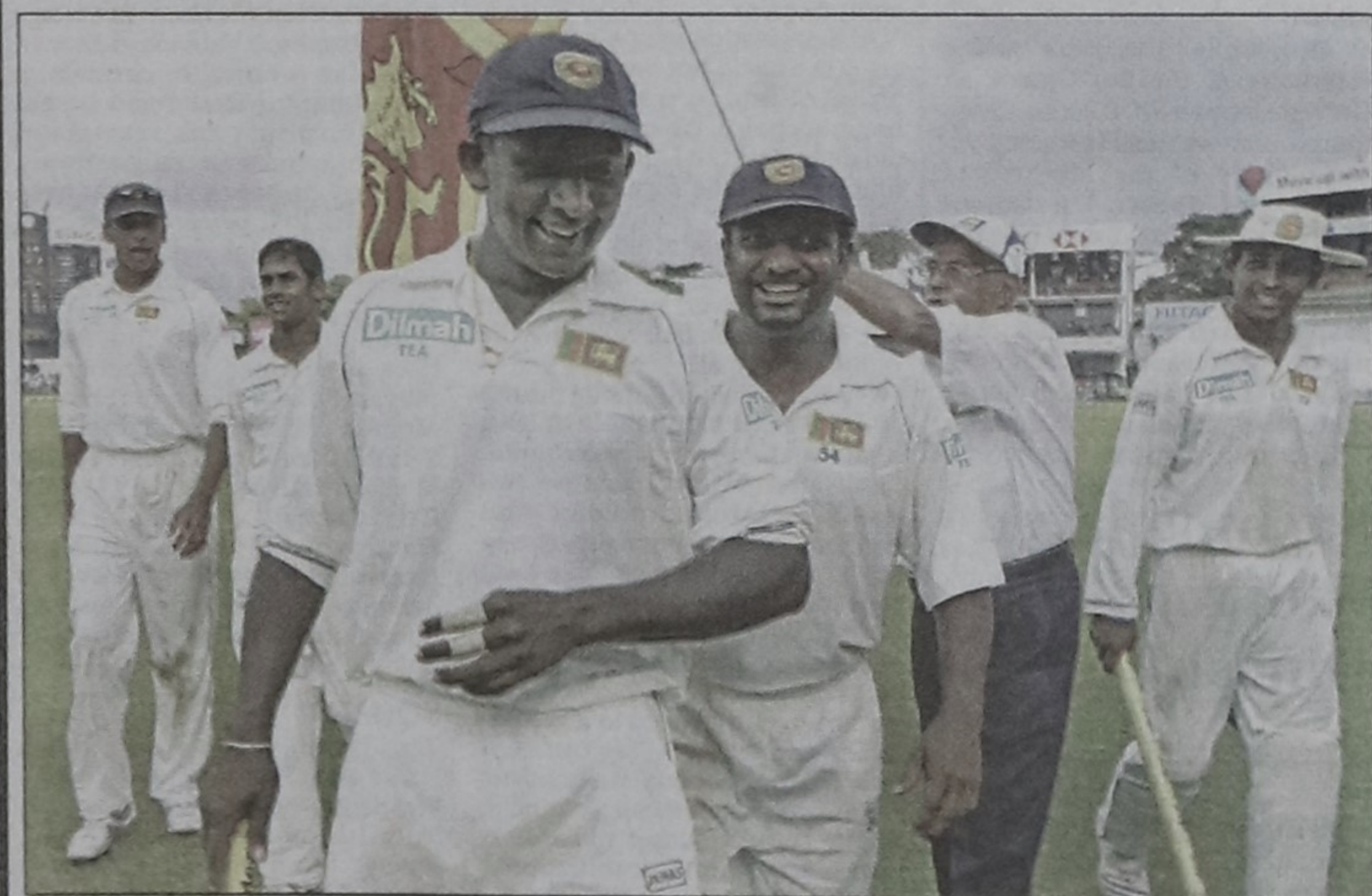
Sri Lankan spin sensation Ajantha Mendis (L) is being asked to lead out by Muttiah Muralidaran after their memorable victory over India on the fourth day of the first Test at the Sinhalese Sports Club ground in Colombo yesterday.