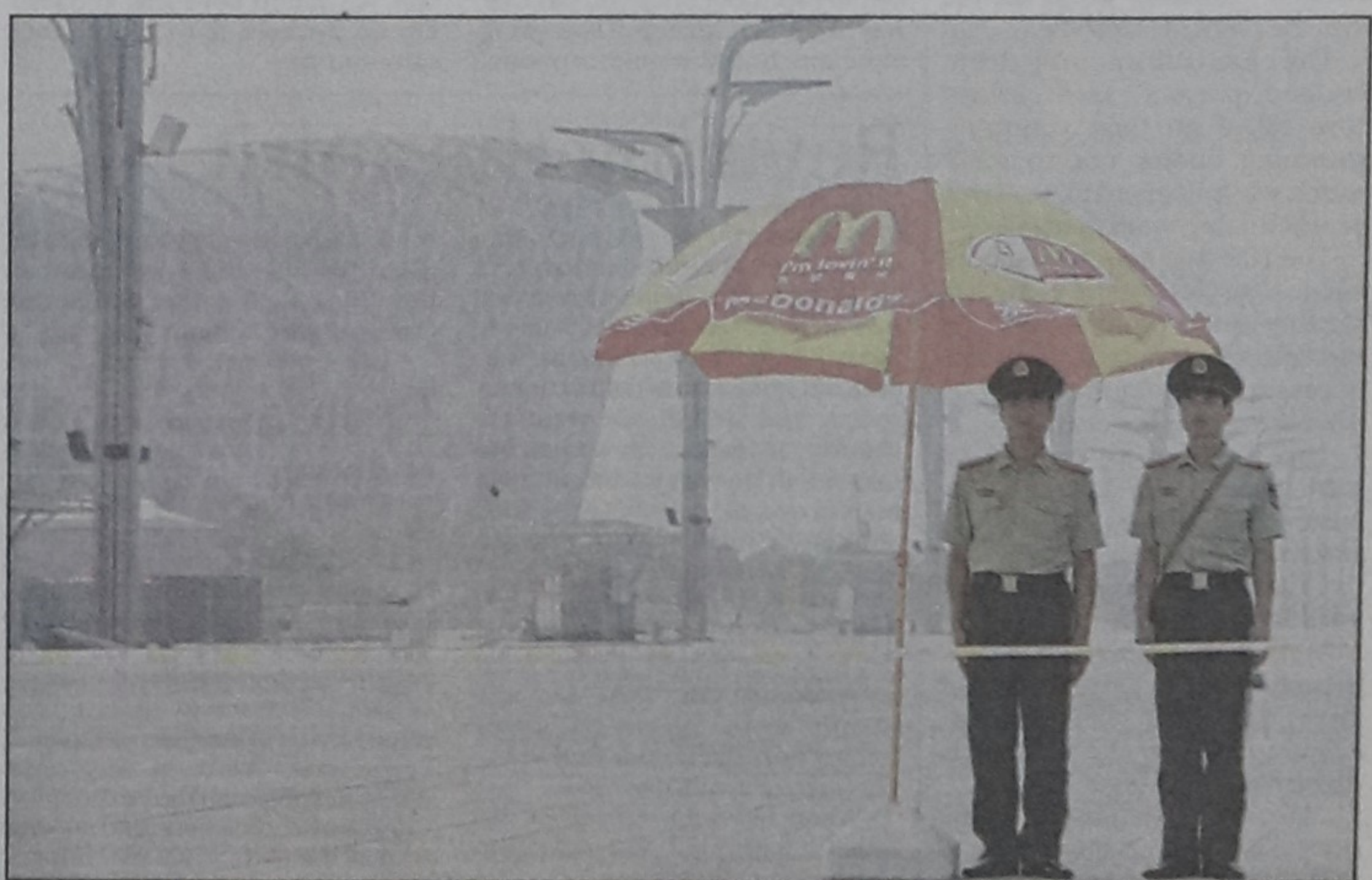
Chinese paramilitary police man their post beneath an umbrella sponsored by US fastfood giant McDonald's in a restricted area near the Olympic Stadium also known as the Bird's Nest in Beijing on Saturday.